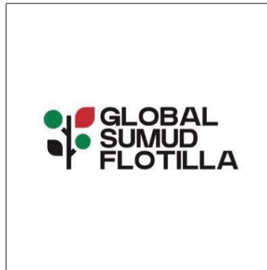
The Flotilla logo (Global Sumud Flotilla website)

(activists from Malaysia and other Southeast Asian countries (Flotilla website, September 1, 2025).