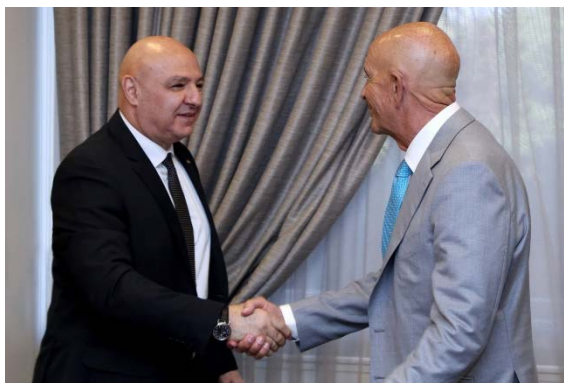
Aoun meets with Barrack

► On July 21, 2025, Thomas Barrack, the American special envoy to Lebanon and Syria, met in Beirut with Lebanese President Joseph Aoun, at the start of a round of meetings with senior state officials, including Prime Minister Nawaf Salam, Nabih Berri, speaker of the Lebanese Parliament, Rodolf Haykal, commander of the Lebanese army, members of parliament, and religious leaders. According to reports, they discussed developments in Lebanon, especially the implementation of the ceasefire in south Lebanon and Hezbollah's disarmament, and regional developments, particularly the clashes in the Druze areas of Syria (Lebanese media, July 21, 2025).