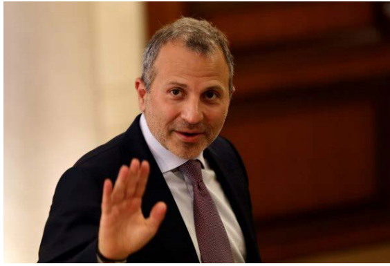
Gebran Bassil (al-Nashra, July 15, 2025)