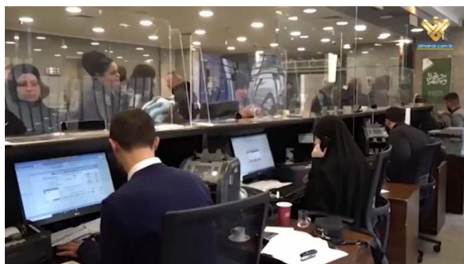
An al-Qard al-Hassan branch (al-Manar, July 19, 2025)

before the fighting, and they issued loans totaling tens of millions of Lebanese pounds each month. He added that they would continue to fulfill their social and financial duties faster and more efficiently despite the pressure and measures taken against them (al-Manar, July 19, 2025).