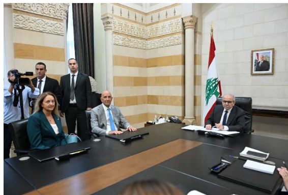
Salam, Barrack and the American ambassador to Lebanon (Lebanon Files, July 21, 2025)

► Following the meeting with Prime Minister Salam, Barrack said the issue of Hezbollah's disarmament was an internal Lebanese matter and they were merely trying to assist, guide and mediate between the sides, not to impose anything on any party, including Israel. However, he emphasized that Hezbollah was designated a terrorist organization by the United States, and therefore he had no dealings with it, only with the Lebanese government. He also refrained from giving specific timelines for disarmament and said lack of progress would be disappointing, but there would be no consequences, and they had no intention of imposing sanctions on Lebanese individuals. Regarding the situation in south Lebanon, he acknowledged that the ceasefire agreement had not achieved its objective and said they were trying to address the causes. He said he had brought forward his visit to Lebanon because the American president wanted to achieve regional stability and Lebanon played a key role in achieving the goal (al-Nashra, July 21, 2025).