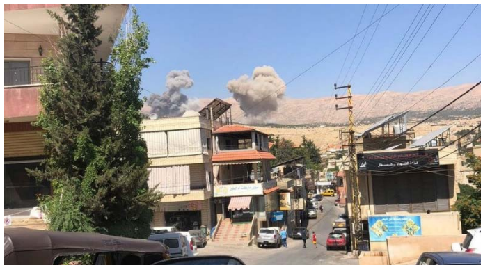
Right: IDF attacks in the Beqa'a Valley (al-Jumhuriya, July 15, 2025). Left: Attack site in Wadi Fara (al-Manar, July 15, 2025)