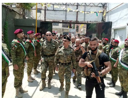
Weapons handover ceremony in Tripoli (Palestinian national security forces Facebook page, July 15, 2025)

► The Palestinian national security forces announced that the committee established by order of Palestinian Authority (PA) chairman Mahmoud Abbas to disarm the Palestinian refugee camps in Lebanon had begun implementing his directive with steps to collect and hand over weapons in areas where the national security forces were deployed, at the Beirut and Burj al-Barajneh headquarters. Similar steps were taken later at the Tripoli regional headquarters. The committee emphasized its full commitment to carrying out the tasks assigned to it. It was noted that the move was carried out as part of the commitment to improving stability and organizing the Palestinian security presence in a way that served the interests of the Palestinian people in the refugee camps and Palestinian gathering areas in Lebanon, in accordance with national policy and the directives of the Palestinian leadership (Palestinian national security forces Facebook page, July 14–15, 2025).