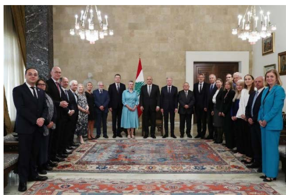
The Lebanese president meets with the EU ambassadors (al-Nahar, July 17, 2025)

► The ambassadors to Lebanon of EU countries held a round of meetings with the heads of state. Nabih Berri, speaker of the Lebanese Parliament, reportedly related to the developments in Lebanon and the region in light of "Israel's failure to comply with UN Resolution 1701 and the ceasefire." After meeting with President Aoun and Prime Minister Salam, the EU ambassadors issued a statement regarding the allocation of new funding to resolve the consequences of the conflict on the country's security and stability, by supporting the Lebanese army and its deployment in the south, rubble removal and strengthening of border security. The ambassadors emphasized the crucial role of UNIFIL in maintaining the stability and security of south Lebanon (al-Nahar, July 17, 2025).