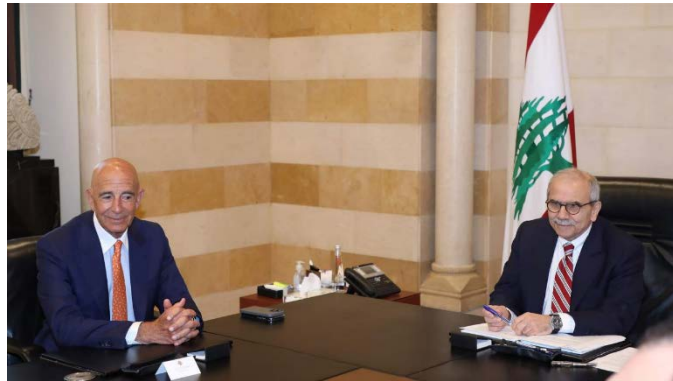
Salam with Barack

of Lebanese prisoners held in Israel. Salam added that Barack had presented ideas about Israeli withdrawal and returning to the ceasefire agreement, and President Joseph Aoun had given him a list of talking points. Barack also met with Nabih Berri, speaker of the Lebanese Parliament. They discussed developments in Lebanon and the region, and that Berri later called the meeting "positive and constructive," saying took into account Lebanon's interests and sovereignty, as well as Hezbollah's demands.