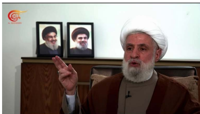
Qassem in the interview (al-Mayadeen, June 11, 2025)

◆ Promoting the "victory" narrative: According to Qassem, despite the pager sabotage and the damage to the organization's leadership, including Nasrallah and Hashem Safi al-Din, Hezbollah had confronted Israel and forced a ceasefire. He claimed Hezbollah "won" because it had prevented Israel from advancing toward Beirut and because Israel had failed to ignite a civil war. He added that the United States was now trying to achieve diplomatically what Israel could not achieve in the war, but Hezbollah had only two options, victory or martyrdom, and surrender was not an option. He warned that Hezbollah would be ready for a confrontation if such a decision were made.