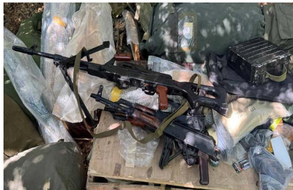
Weapons discovered by IDF forces in south Lebanon