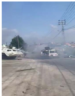
UNIFIL force fires tear gas canisters during clashes in Aitaroun (Lebanon Debate, July 10, 2025)

► "Government sources" confirmed that following the recent friction between residents in south Lebanon and UNIFIL forces, strict instructions would be given to the security forces to arrest those who attacked the UN soldiers. They noted that ongoing contacts were taking place between Lebanese officials and the UN force command in al-Naqoura, and claimed that everyone was aware of the importance of the force's role in Lebanon, especially at this time (al-Sharq al-Awsat, July 10, 2025).