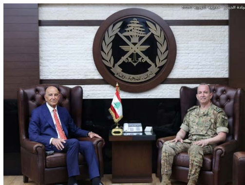
Heikal and Barack meet (Lebanese Army X account, July 8, 2025)

► The Pentagon announced that the United States State Department had approved a potential sale to Lebanon of maintenance equipment for A-29 Super Tucano aircraft, worth $100 million. The aircraft are used to support ground forces, for intelligence gathering and aerial reconnaissance. It was noted that the sale would enhance the security of a partner nation which continued to be a force for political stability and economic development in the Middle East, though it would not change the basic regional military balance (Defense Security Cooperation Agency website, July 11, 2025).