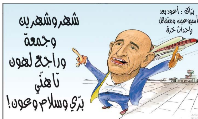
American envoy Barack: I'll return in two weeks and I'm optimistic about a breakthrough. The Arabic reads, "A month, months and a week" [a song by the singer Fairouz] and I'm coming back here to congratulate Berri, Salam, and Aoun!" (al-Liwa, July 9, 2025)

► Senior Hezbollah figures continued to express public opposition to the demand to disarm and said any dialogue about the future of the "resistance" 2 could begin only after the demand to stop Israeli attacks and withdraw from the five points it holds in south Lebanon had been met: