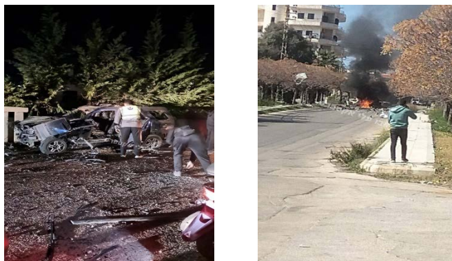
The IDF targeted two vehicles carrying Hezbollah operatives who were violating the ceasefire agreement. Right: Attack in Bourj al-Muluk. Left: Attack in the village of Yater

the Litani River. Four Hezbollah operatives were reportedly killed and several others were wounded (IDF spokesperson, March 10–17, 2025).