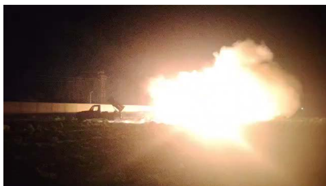
Syrian army forces fire rockets at Lebanon in the al-Qusayr area along the Syria-Lebanon border (Telegram channel Saber News, March 16, 2025)