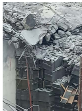
Hezbollah operatives evacuating crates of ammunition from a site bombed by the IDF during the war

► Ibrahim al-Amin, editor of Hezbollah's daily al-Akhbar, wrote an editorial claiming that any attempt to dismantle the "resistance" 2 by force would lead to civil war, and that no force in Lebanon was capable of carrying out such a task. He called for Israel's immediate withdrawal from Lebanon, arguing that the points where the IDF was present had been taken by force. He claimed President Aoun, Prime Minister Salam and Lebanese military commanders were weak and allowed the United States to exert remote control over Lebanon's decision-making. He said the United States did as it pleased through the oversight committee because it knew there