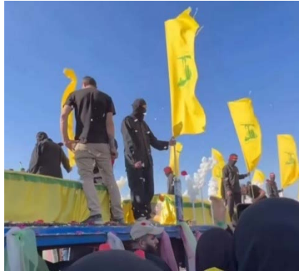
Coffins of Hezbollah terrorist operatives at the funeral in Maroun al-Ras (al-Mayadeen, March 16, 2025)