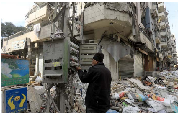
A damaged electrical panel on a utility pole in Lebanon (al-Akhbar, March 17, 2025)

► According to the World Bank, direct and indirect damages to Lebanon's energy sector and electricity production amounted to $307 million, including $98 million in direct damages to the power grid and stations and $209 million in indirect damages. The worst damage was in south Lebanon. The cost of restoring the electricity sector to operational capacity is estimated at $147 million (al-Akhbar, March 17, 2025).