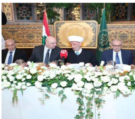
From right to left: Lebanese Prime Minister Salem, Sunni Mufti Daryan, Lebanese President Aoun and Parliament Speaker Berri at a festive iftar [Ramadan fast-breaking] dinner hosted by the Mufti (al-Nashra, March 15, 2025)

► Nabih Berri, the speaker of the Lebanese Parliament, also issued a statement marking the anniversary, saying, "firm positions are what unite the Lebanese in defending their national rights." He referred to "the difficult phase the Arab region is experiencing" and called on the Druze community "to emphasize their steadfastness, adhere to their Arab and Islamic identity, be part of the state in Syria and Lebanon, always stand by Palestine and its just cause and not fall into the enemy's traps" (al-'Ahed, March 16, 2025).