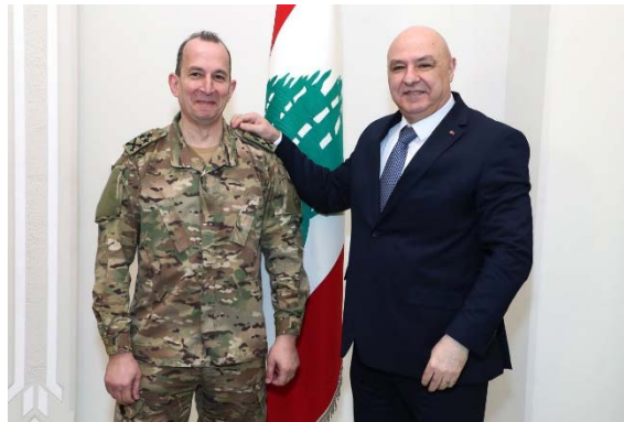
Lebanese President Joseph Aoun awarding the ranks to the new commander of the Lebanese Army, Rudolf Haykal