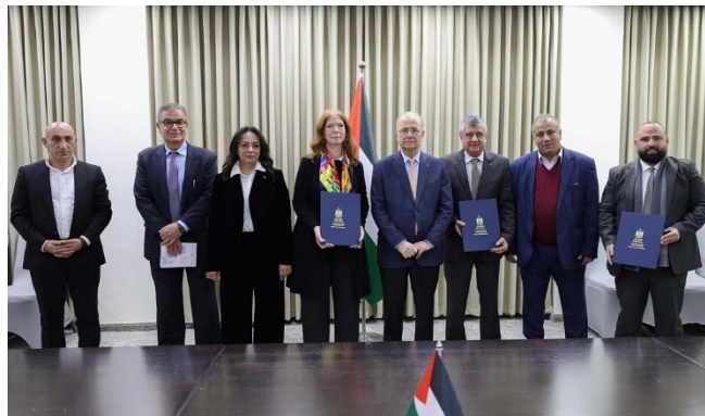
Mustafa (fourth from the right) (Wafa, February 10, 2025)

► A memorandum of understanding worth $80 million was signed between the UN Development Programme and the Arab and International Organization for Reconstruction in "Palestine" 6 for damage assessment, debris removal and the construction of temporary shelters in the Gaza Strip under the supervision of the PA's ministry of public works and housing. According to the agreement, $40 million will be allocated for temporary shelters, debris removal and technical assistance, along with efforts to raise an additional $126 million for recovery in Gaza. The memorandum was signed in the office of PA Prime Minister Muhammad Mustafa, who said the initiative would increase government efforts to operate on the ground and address the emergency situation. He also gave his assurance that the PA would continue working towards the full reconstruction of the Gaza Strip (Wafa, February 10, 2025).