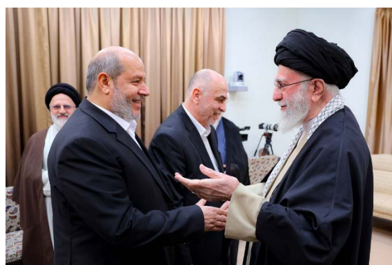
Right: Khamenei with senior Hamas figures.