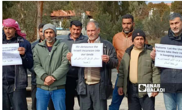
Protest demonstration in al-Baath (Enab Baladi, January 27, 2025)

► During a visit by a UN delegation, Syrian residents in the city of al-Baath in Quneitra Province held a demonstration to protest the incursion of Israeli forces. The protesters, standing only 300 meters from IDF forces, held signs reading "We condemn the Israeli incursion into our lands" and called for the deployment of UN peacekeeping forces. No clashes were reported (Enab Baladi and Syria TV , January 27, 2025).