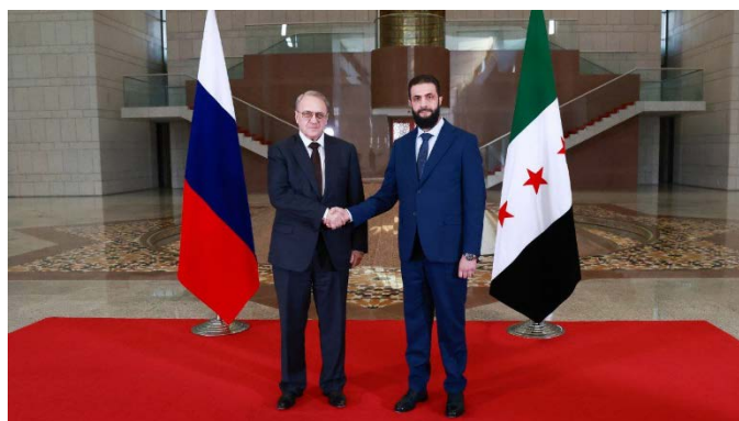
Al-Sharaa (right) and Bogdanov (Syrian News Agency, January 29, 2025)

►Al-Sharaa met with Russian Deputy Foreign Minister Mikhail Bogdanov, the Russian president's special envoy to the Middle East. It was the first visit of a senior Russian official to Damascus since the fall of the Assad regime. According to reports they discussed respect for Syrian sovereignty and territorial integrity, and establishing a mechanism to ensure justice for victims of the Assad regime during the civil war. The Syrian leadership noted that the renewal of bilateral relations had to deal with past mistakes, respect the will of the Syrian people and serve their interests. According to reports, the meeting focused on Russia's role in rebuilding trust with the Syrian people through tangible steps, such as compensation and reconstruction (Syrian News Agency, January 29, 2025). Al-Sharaa reportedly requested that Russia extradite Bashar Assad and his senior aides who had sought asylum in Russian territory (Reuters, January 29, 2025).