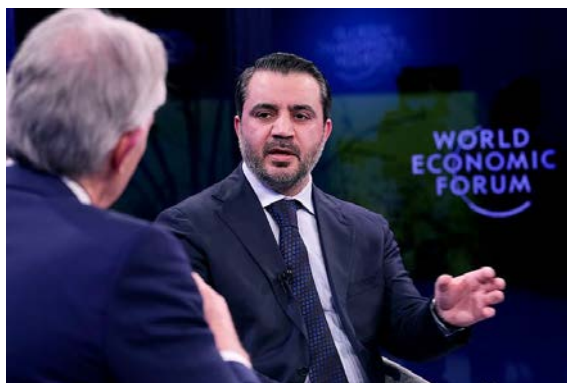
Al-Shibani and Tony Blair at the Davos Economic Forum

►Syrian Foreign Minister Asaad al-Shibani participated in the World Economic Forum in Davos, the first time a Syrian representative had attended the meeting. In a public conversation with former UK Prime Minister Tony Blair, al-Shibani emphasized the new government's commitment to rebuilding Syria through the governance of all communities in the country, monetary reforms and fostering international partnerships to drive economic growth and stability. He also called on the international community to lift sanctions on Syria and pledged to change the image of the Assad regime's era, which portrayed Syria as a source of Captagon and refugees. He also reiterated that Syria would not pose a threat to any country and would be a "nation of peace" (Syria TV, January 22, 2025).