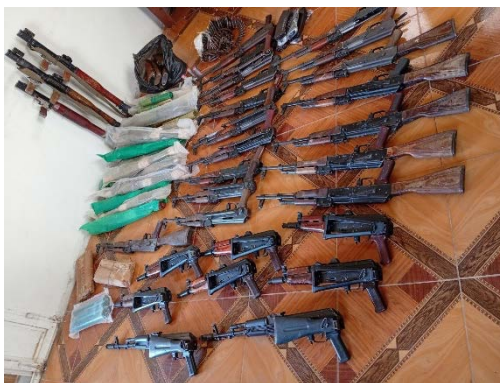
The weapons seized in Serghaya (Syrian News Agency, January 26, 2025)