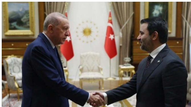
Al-Shibani and Erdogan in Ankara

► Syrian Foreign Minister al-Shibani headed a Syrian delegation to Ankara, the first visit since the fall of the Assad regime. He met with President Erdogan and Hakan Fidan, the foreign minister. According to reports, they discussed recent developments in Syria and measures for preserving the country's territorial integrity. Erdogan said Turkey would support the needs of their Syrian "brothers" and the country's reconstruction (Anadolu Agency, January 15, 2025).