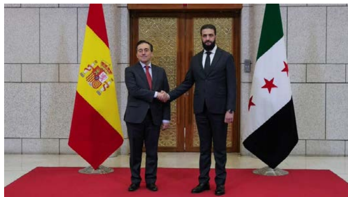
Right: Al-Sharaa and the Spanish foreign minister. Left: Al-Sharaa meets with Chief Prosecutor Khan

► Syrian Foreign Minister al-Shibani headed a Syrian delegation to Ankara, the first visit since the fall of the Assad regime. He met with President Erdogan and Hakan Fidan, the foreign minister. According to reports, they discussed recent developments in Syria and measures for preserving the country's territorial integrity. Erdogan said Turkey would support the needs of their Syrian "brothers" and the country's reconstruction (Anadolu Agency, January 15, 2025).