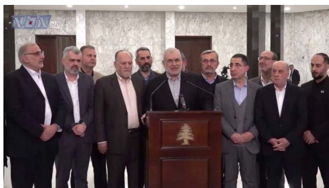
Press conference held by Hezbollah's Loyalty to the Resistance faction in the Lebanese Parliament

▶ Mohammad Raad, head of Hezbollah's Loyalty to the Resistance faction in the Lebanese Parliament, said the faction had not selected any representative for the position of prime minister. He claimed Hezbollah had taken a positive step by supporting the election of President Aoun, but "its outstretched hand was cut off." He noted that the organization would "wait calmly and act wisely" out of concern for Lebanese national interest but would continue monitoring the government's actions "to expel the occupier from our land" (Radio al-Nour, January 13, 2025).