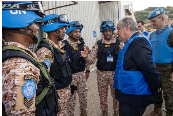
Guterres at a UNIFIL outpost visit (Lebanese National News Agency, January 17, 2025)

▶ UN secretary general Guterres visited UNIFIL headquarters in Ras al-Naqoura, where he said that since the ceasefire began the force had found more than 100 weapons depots belonging to Hezbollah and its allies in south Lebanon. He added that the presence of armed personnel and weapons, other than those of the Lebanese army and UNIFIL, constituted a violation of Security Council Resolution 1701. He also criticized the [alleged] "ongoing occupation by the Israeli military" in UNIFIL's area of operations and called for an end to Israeli military actions in Lebanese territory, as they violated the resolution (Lebanese National News Agency, January 17, 2025).