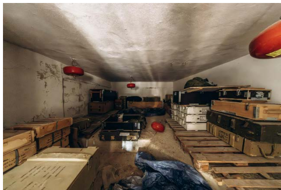
Weapons found and destroyed (IDF spokesperson, January 16, 2025)