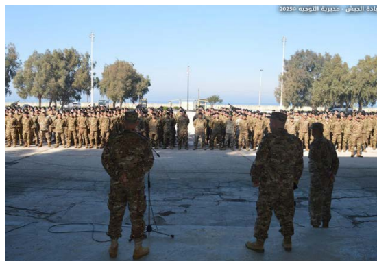
The new recruits in the Lebanese army (Lebanese army X account, January 14, 2025)

► The Lebanese army announced that soldiers had been recruited in the first phase of the plan to strengthen military units deployed in the south. According to the plan, the army was expected to recruit 6,000 soldiers to work towards implementing UN Security Council Resolution 1701 (Lebanese Army X account, January 14, 2025).