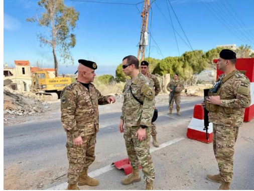
General Jeffers visits Lebanese army checkpoints (American Embassy website, January 15, 2025)

Lebanese army's checkpoints were operating efficiently, with soldiers undertaking the mission of maintaining Lebanon's security (American Embassy in Lebanon website, January 15, 2025).