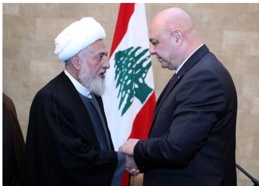
Sheikh Ali al-Khatib (left) meets with Aoun (al-Nashra, January 14, 2025)

the Israeli withdrawal and to deploy Lebanese army forces in the south. Regarding the disarmament of Hezbollah, Sheikh al-Khatib said, "The weapons are not sacred to us; the unity of the state and the dignity of the people are." (al-Nashra, January 14, 2025).