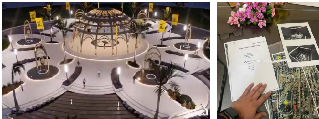
Right: The map of the burial site complex in Beirut (Shaheed Hassan Nasrallah Instagram channel, January 16, 2025). Left: A model of the burial site (al-Janoubiya, January 17, 2025)

accounts presented a video of "the shrine" to be built in the Dahiyeh al-Janoubia in Beirut (al-Janoubiya, January 17, 2025).