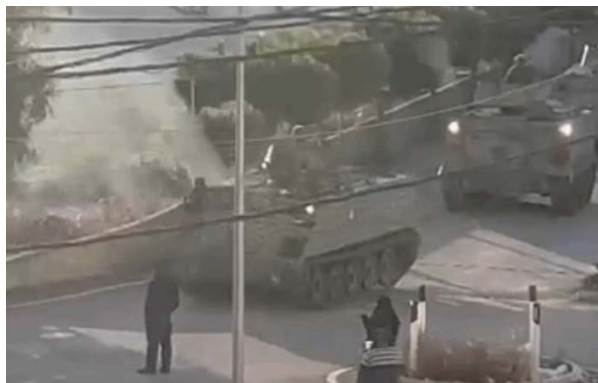
Lebanese army APCs deployed in Bint Jbeil (Lebanon24, January 19, 2025).

► This the past week, the Lebanese army continued deploying its forces in areas evacuated by the IDF in south Lebanon. It was reported that army units completed their deployment in the towns of Ain Ebel, Debl, Rmeish-Bint Jbeil, Bint Jbeil and Ainata in coordination with UNIFIL forces and the ceasefire monitoring committee. Reportedly, the forces were working to open roads, clear unexploded ordnance and remove suspicious objects "left by the Israeli enemy as it continues to violate the ceasefire and attack Lebanon's sovereignty." Residents were also told not to return to their homes yet (Lebanese Army X account, January 19, 2025).