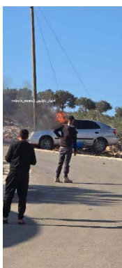
A vehicle set on fire in Beit Furik (Nablus News Telegram channel, November 16, 2024)