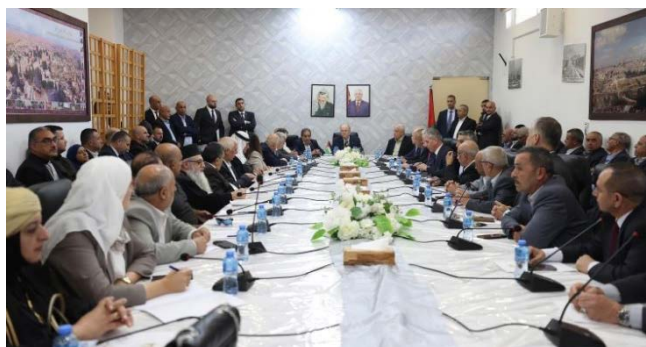
Mustafa (at the head of the table) meeting with local activists in Bethlehem (Wafa, November 16, 24)