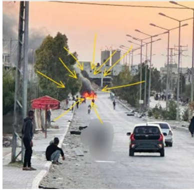
Gang leader’s vehicle on fire after being hit by a rocket fired at it by the Sahm forces (Amsak Amil Telegram channel, November 18, 2024; journalist Ahmed Fawzi’s X account, November 18, 2024)

committees on behalf of the clans and that the security activity would expand to eradicate truck theft (al-Aqsa TV, November 18, 2024).