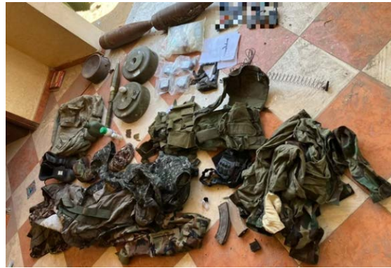
Weapons and launchers found in the Jabalia area (IDF Spokesperson, November 12, 2024)

► Hamas authorities in the Gaza Strip continued to accuse Israel of killing dozens of civilians and deliberately damaging civilian infrastructure in the northern Gaza Strip: