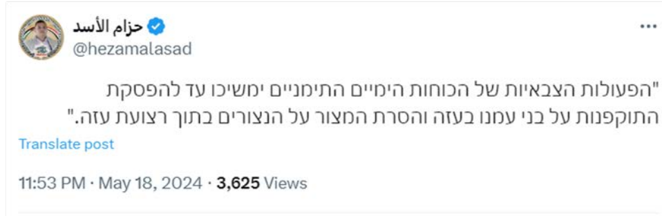
Hezam al-Asad's tweet in Hebrew (Hezam al-Asad's X account, May 18, 2024)