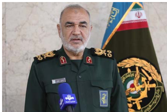
IRGC Commander Hossein Salami (SNN. IR, May 20, 2024)

►IRGC commander Hossein Salami said in a speech in Tehran that the Iranian attack on Israel had been a limited operation against two military bases, using a limited number of missiles and UAVs to punish Israel (Mehr, May 19, 2024).