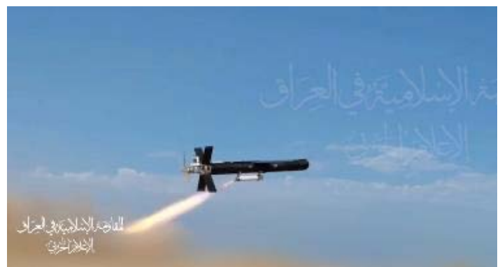
Right: UAV fire at a “vital target” in Eilat (Islamic Resistance in Iraq Telegram channel, May 17, 2024); Left: UAV launched at a base in the Golan Heights (Islamic Resistance in Iraq Telegram channel, May 21, 2024)