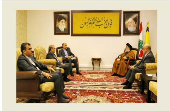
Abdollahian meets with Nasrallah in Beirut (Tasnim, February 10, 2024)