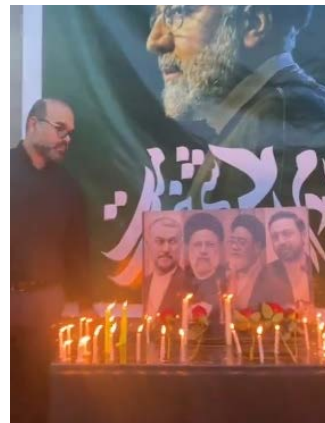
Right: A ceremony held by the militias in Baghdad in memory of Raisi and the other fatalities ; Left: Flags of the Islamic Resistance in Iraq at Raisi's funeral in Tehran