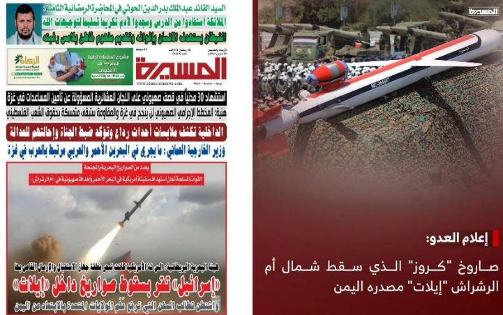
Right: The cruise missile that the Houthis claim was launched and exploded north of Eilat (al-Masirah Telegram channel, March 19, 2024). Left: The al-Masirah homepage reports the attack in Eilat (al-Masirah Telegram channel, March 20, 2024)

under investigation (IDF spokesperson, March 19, 2024 ). It was the first time a Houthi missile or UAV had penetrated Israeli airspace and landed in its territory. Another Houthi attack on Eilat was recorded on March 21, 2024, when a "suspicious aerial target" was intercepted by the IDF before it entered Israeli territory (IDF Account X, March 21, 2024).