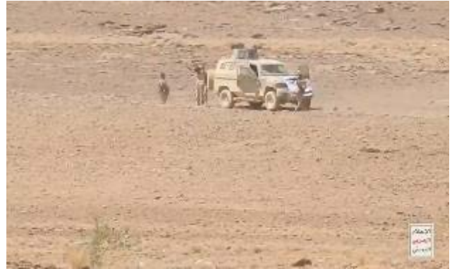
Right: Simulation of kidnapping an Israeli soldier (Houthi combat information X account, March 9, 2024). Left: Simulation of occupying an Israeli post and kidnapping soldiers (Houthi media information center, February 3, 2024)