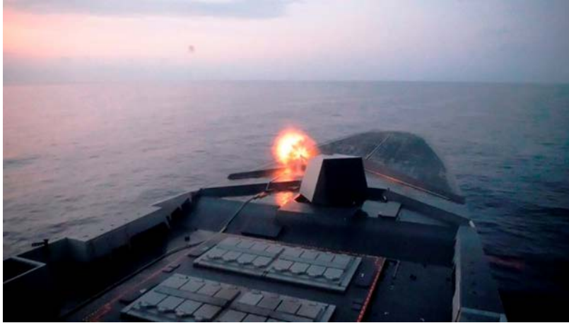
A French destroyer, part of the European Red Sea Task Force during the interception of four drones launched by the Houthis (European Red Sea Task Force X Account, March 9, 2024)