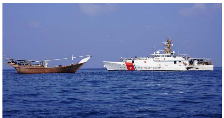
An Iranian ship smuggling weapons to the Houthis and captured by the United States Navy, and the weapons found aboard (CENTCOM X account, February 15, 2024)