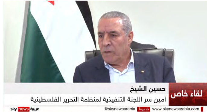
Hussein al-Sheikh, secretary general of the PLO's Executive Committee, in an interview (Sky News in Arabic, December 13, 2023)

to create a unified Palestinian consensus and, according to him, they were paying a heavy price for that. He called on Hamas to recognize the PLO's plan to defend the Palestinian project (Sky News in Arabic, December 13, 2023).