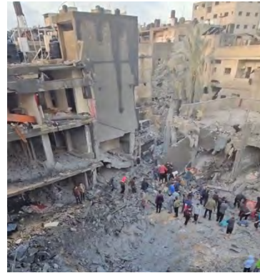
Right: A residential area in Jabaliya attacked by the Israel Air Force at night (QudsN X account, December 14, 2023). Left: Evacuating casualties in Jabaliya (QudsN X account, December 14, 2023)

► The southern Gaza Strip: IDF activity continued to focus on the Khan Yunis area. The forces raided several focal points, finding guns, grenades and Kalashnikov rifles. In one of the compounds, the forces destroyed two shafts, a rocket launch pit and a weapons storehouse (IDF spokesperson, December 14, 2023). IDF forces raided a school building, eliminated a terrorist squad and located an underground combat facility. In Bani Suheila, in the Khan Yunis area, the forces killed a large number of terrorists in close encounters, with the help of tanks and airstrikes. They destroyed terrorist facilities, a Hamas communications center and terrorist meeting points (IDF spokesperson, December 13, 2023).