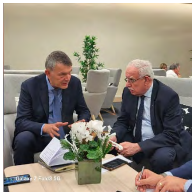
Palestinian foreign minister meets with UNRWA Commissioner General Lazzarini in Geneva (Palestinian foreign ministry Telegram channel, December 13, 2023)

► Riyadh al-Maliki, Palestinian foreign minister , met in Geneva with UNRWA Commissioner General Philippe Lazzarini on the sidelines of a global conference on refugees. Al-Maliki said they opposed all attempts to undermine the agency by cutting off its funding and making false accusations against it to put an end to the Palestinian refugee issue. Lazzarini said UNRWA fulfilled and would fulfill all its obligations toward the Palestinian refugees (Palestinian foreign ministry Telegram channel, December 13, 2023).