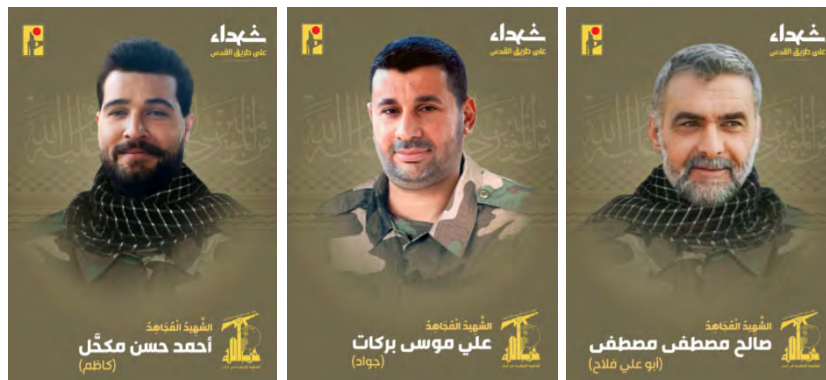
Hezbollah fatalities (Hezbollah combat information wing, December 13, 2023)