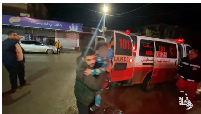
Evacuating casualties to the hospital in Rafah following the Israeli Air Force attack

►The Palestinian media reported that during the night the Israeli Air Force had attacked two houses in the center of Rafah; 27 deaths were reported. In the morning, the funerals of the dead were held in Rafah (QUDSN account X, December 14, 2023).