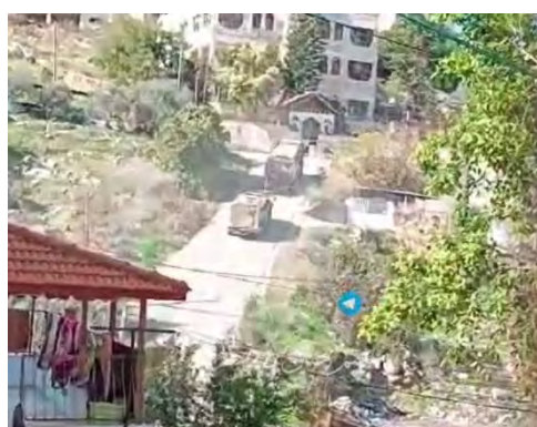
Right: Israeli security forces activity in Jenin (Jenin refugee camp 24 hours Telegram channel, December 14, 2023). Left: Israeli security force activity in the early morning hours in Jenin (QudsN X account, December 14, 2023)

► The PA foreign ministry condemned the IDF activity in Jenin and warned of its consequences. According to the foreign ministry, Israel ignored all international appeals and calls for protecting Palestinian residents. It called on the American administration to put an end to the actions against the Palestinian people.