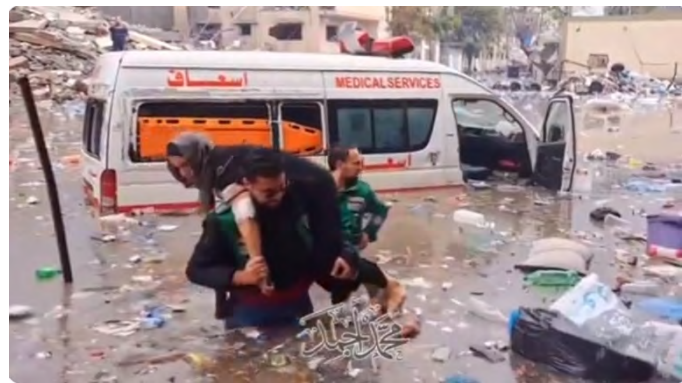
Rainwater floods the Jabaliya refugee camp