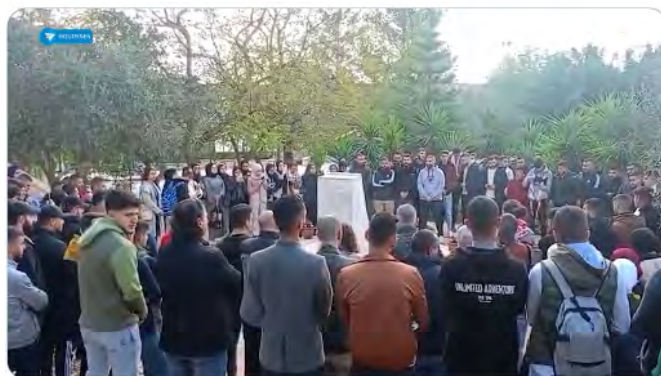
The Event at Birzeit University (QudsN X account, December 14, 2023)

► On the afternoon of December 14, 2023, Birzeit University held a solidarity event with the Palestinians in the Gaza Strip and Jenin, initiated by the university's student council (Islamic Bloc at Birzeit University Telegram channel, December 13, 2023).