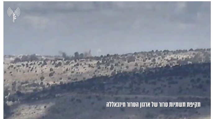
The IDF attacks Hezbollah targets in south Lebanon (IDF spokesperson, December 14, 2023)