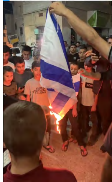
Right: Demonstrators burn an Israeli flag in the town of Tammun, south of Tubas (QudsN Telegram channel, November 5, 2023). Left: A student march in Ni'lin (QudsN Telegram channel, November 6, 2023)