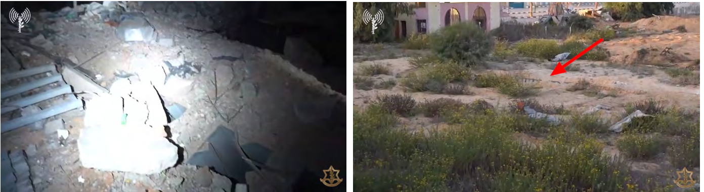
Right: Rocket launch pits in a playground in the Gaza Strip. Left: Launchers near children's wading pools in the Gaza Strip

► Rocket fire, which has not stopped since the first day of the fighting, continued. Several dozen rockets were launched during the past day, most of them at the cities, towns and villages near the Gaza Strip. Several barrages were launched at the center of the country and Beersheba. No casualties were reported; property was damaged. The IDF spokesman revealed the location of launch pits and rocket launchers near civilian facilities, including a playground and a children's wading pool.