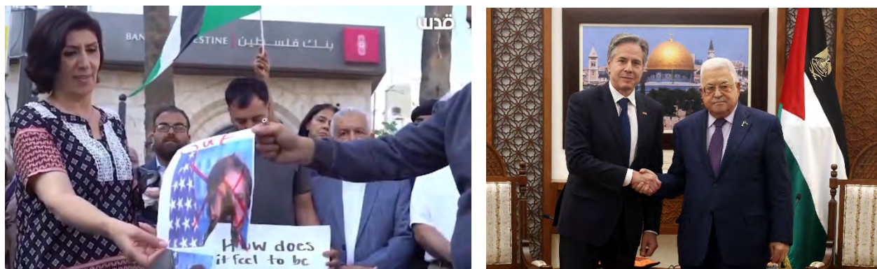
Right: Mahmoud Abbas meets in Ramallah with Secretary of State Blinken (Wafa, November 5, 2023). Left: Demonstrators in Ramallah burn a picture of Blinken (QudsN Twitter account, November 5, 2023)

► PA Prime Minister Muhammad Shtayyeh met with the French consul general in Jerusalem. Shtayyeh stressed the need for the international community to take responsibility and stop the aggression immediately and bring humanitarian and medical aid, fuel and water into the Gaza Strip. They also discussed France's preparations for an international conference, led by the French president and with the participation of other presidents and foreign ministers, for humanitarian aid to the Gaza Strip (Wafa, November 5, 2023).