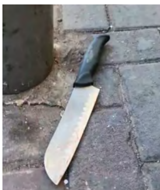
The knife used in the stabbing in Jerusalem

► On the morning of November 6, 2023, an Arab from east Jerusalem armed with a knife stabbed two Border Police fighters near the Shalem station in east Jerusalem. A female fighter was critically wounded and later died; the other fighter sustained minor injuries. The terrorist was shot and killed by police, who also detained an accomplice near the scene of the attack. The terrorist was reportedly Muhammad Omar al-Farrukh, 16, from Issawiya (Israel Police Force Facebook page; Shehab, November 6, 2023).