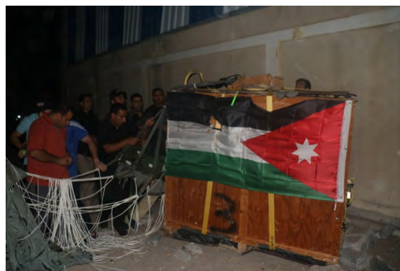
Unloading aid from Jordan

► King Abdullah II of Jordan said that the Jordanian Air Force had air lifted urgent medical aid to the Jordanian Hospital in the Gaza Strip (King Abdullah's Twitter account, November 6, 2023).