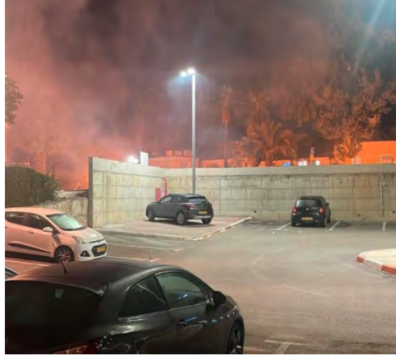
Right: A fire that broke out in Beer Ya'akov following a rocket hit from Gaza (Shehab Twitter account, November 5, 2023). Left: A direct rocket hit in an Israeli community near the Gaza Strip (QudsN Twitter account, November 5, 2023)