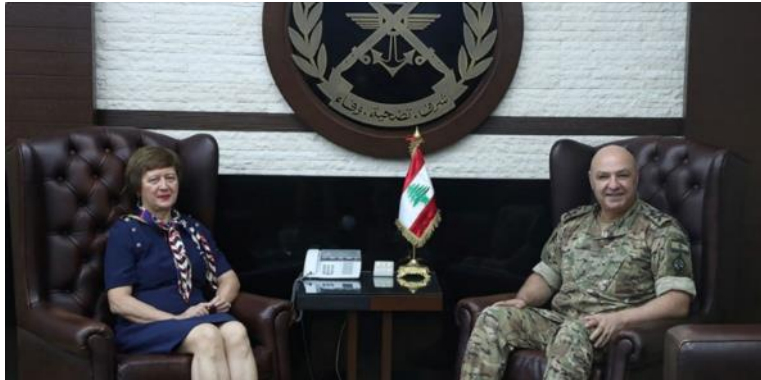
Joseph Aoun alongside the UN Special Coordinator for Lebanon (Twitter account of the Lebanese army @LebarmyOfficial, September 26, 2023)