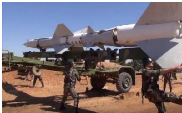
Soviet-made S-75 Dvina missile in the Syrian army (topwar.ru, May 31, 2023)

► It is difficult to determine based on this report which missile it is since the S-75 Dvina missile is an old Soviet-made surface-to-air missile (from 1957) that was never supplied to Iran. According to a report by a Russian military website, the Dvina missile has been used by the Syrian army and has proven itself to be an effective system (topwar.ru, May 31, 2023).