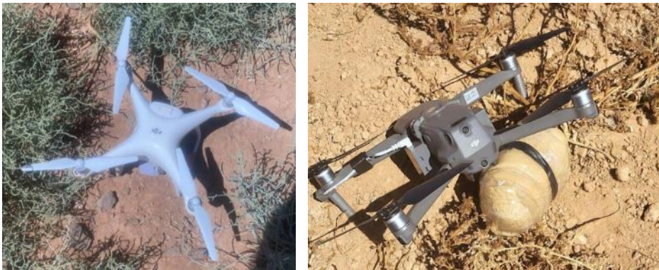
The drones shot down by the Jordanian army

► The Jordanian army announced that it had shot down two drones loaded with shipments of crystal meth on the Jordanian-Syrian border. It should be noted that the smuggling of weapons and drugs from Syria to Jordan is carried out with the backing of the Syrian government, Hezbollah, and Iran (Jordanian Army website, September 26, 2023). On September 21, 2023, the Syrian Observatory for Human Rights published an investigative report on smuggling activity from southern Syria to Jordan. The article notes that Hezbollah plays a central role in smuggling activity, operating in coordination with Syrian security forces. In addition, the article indicates that Hezbollah supplies the raw materials to produce drugs and that drones are extensively used for smuggling in southern Syria, although smuggling also takes place by crossing the border on foot. The article notes that the village of Al-Shi'aab, in the As-Suwayda Province, is one of the most prominent centers from which smuggling to Jordan originates. It should be noted that Jordan is not the only destination country for the drugs and that they are smuggled from there to the Gulf states and apparently also to Judea and Samaria, Israeli territory, and other areas around the world.