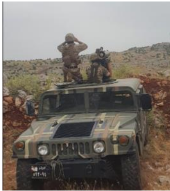
Photos released by the Lebanese army documenting the incident on the Israeli-Lebanese border (Lebanese army Twitter account, @LebarmyOfficial, September 23, 2023)