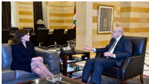
Lebanon's interim prime minister at a meeting with the US ambassador (Al-Modon, September 22, 2023)