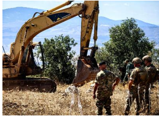
Lebanese army soldiers escort the bulldozer paving a new military road along the border with Israel