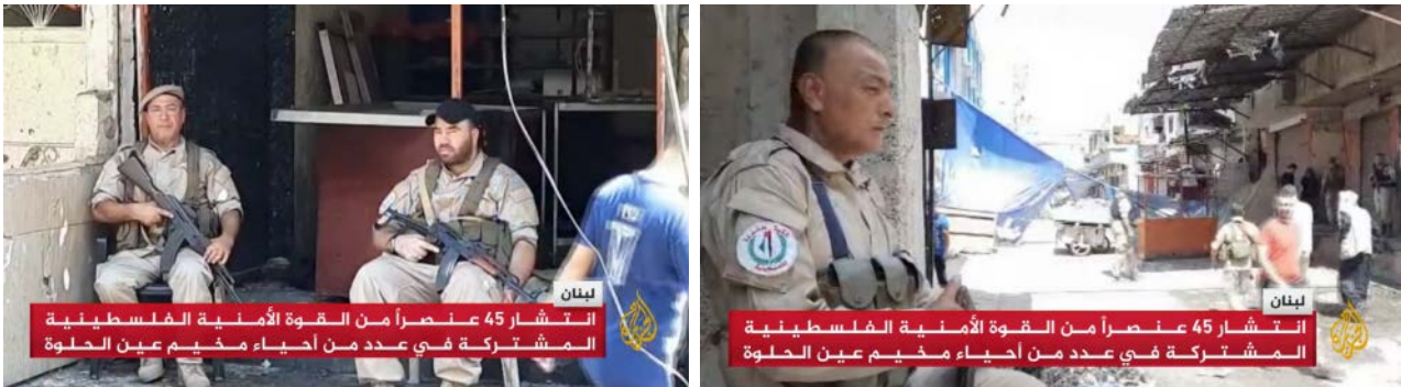
Some of the operatives of the joint security force in the Ein al-Hilweh refugee camp

Speaker Nabih Berri, to which Hezbollah was a partner, created the appropriate atmosphere for resuming joint activity. It was also reported that the understandings between the sides are based on several clauses, including a ceasefire, the surrender of those wanted for the murder of Fatah's national security force commander Abu Ashraf al-Armoushi and four of his escorts, and not taking steps intended to bring about military achievements under the pretext of the current crisis (Al-Quds News Agency; Al-Jazeera, September 26, 2023).