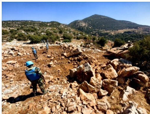
Lebanese army soldiers in the Har Dov works area