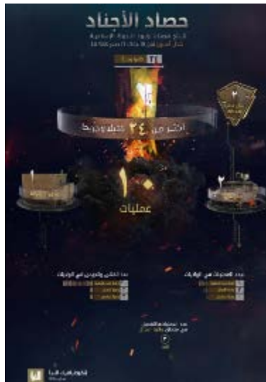
Summary of ISIS attacks (Al-Naba weekly, Telegram, September 7, 2023)