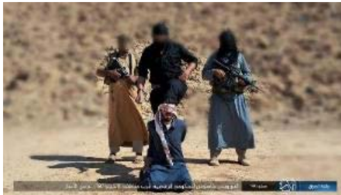
One of the “spies” just before his execution (Telegram, September 11, 2023)

► On September 11, 2023, ISIS announced that it had executed two “spies” operating for the Iraqi government in the Al-Kubaisa area, western Iraq. ISIS released photos documenting the execution (Telegram, September 11, 2023).