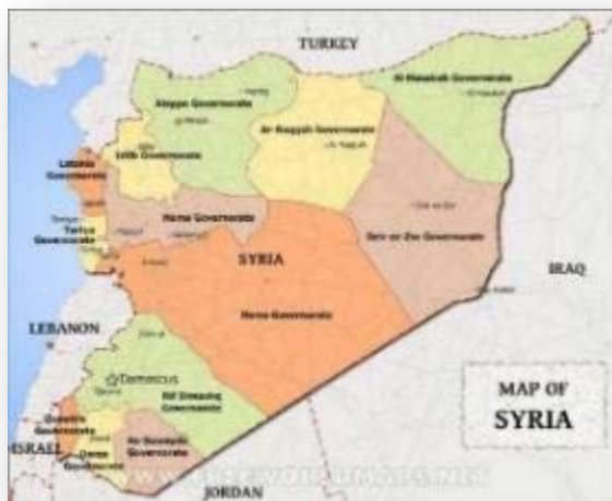
Provinces of Syria (Free World Maps)