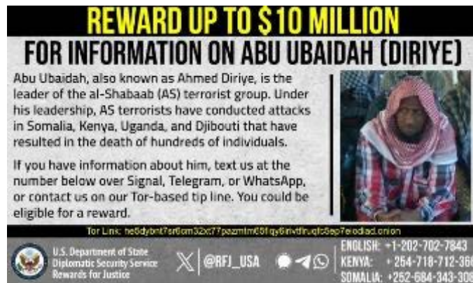
US State Department announcement (Rewards for Justice Twitter account, September 7, 2023)

► On September 7, 2023, the US Department of State announced that it is offering a reward of up to $10 million for information about Al-Shabaab leader Abu Ubaidah, known as Ahmed Diriye. According to the announcement, Abu Ubaidah is responsible for the deaths of hundreds of people in Somalia, Kenya, Uganda, and Djibouti (Rewards for Justice Twitter account, September 6, 2023).