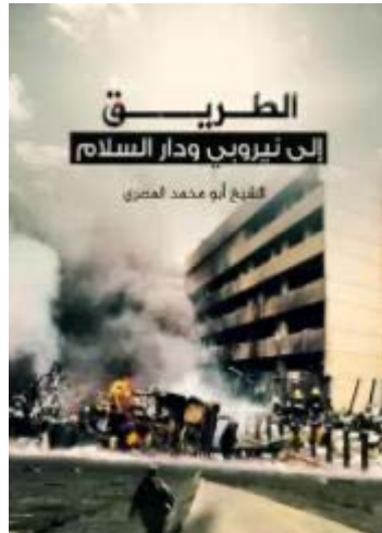
The book “The Road to Nairobi and Dar al-Salam” (Matbaat Noor, September 7, 2023)

attention. An examination of the book reveals many details about the planning and execution of the attack (Matbaat Noor, September 7, 2023).