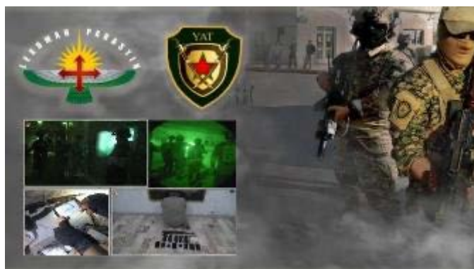
Weapons and documents found and documentation of the operation of the Kurdish SDF forces in collaboration with the Global Coalition (SDF Press, September 8, 2023)

► On September 8, 2023, the SDF Information Office announced that on September 7, 2023, the SDF forces had completed an operation against ISIS operatives in the Al-Raqqah region. The operation was carried out in collaboration with the forces of the US-led Global Coalition against ISIS and the forces of the autonomous Kurdish government in northern Iraq. During the operation, an ISIS commander (emir) in charge of the organization's finances (in charge of ISIS's Islamic Bank) was detained. He was also in charge of ISIS's relations with the tribes (Diwan al-Ashaer) in the Al-Raqqah area. The detainee is accused of transferring money and equipment to ISIS operatives to carry out attacks. During the operation, Kalashnikov rifle magazines, memory cards, and cell phones were found (SDF PRESS, September 8, 2023).