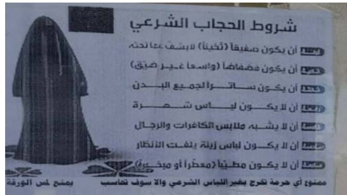
One of the leaflets posted by ISIS operatives

►On August 6, 2023, ISIS operatives hung leaflets on several houses in the town of Al-Tayyana, about 7 km southeast of Al-Mayadeen, threatening to execute the women in that town if they did not adhere to strict Sharia clothing (i.e., clothing that covers the woman's entire body, including her face and hands) (Syrian Observatory for Human Rights, August 6, 2023). This is an ISIS attempt to impose its governance in the region.