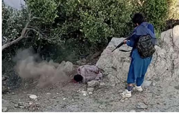
ISIS operative shoots the “spy”