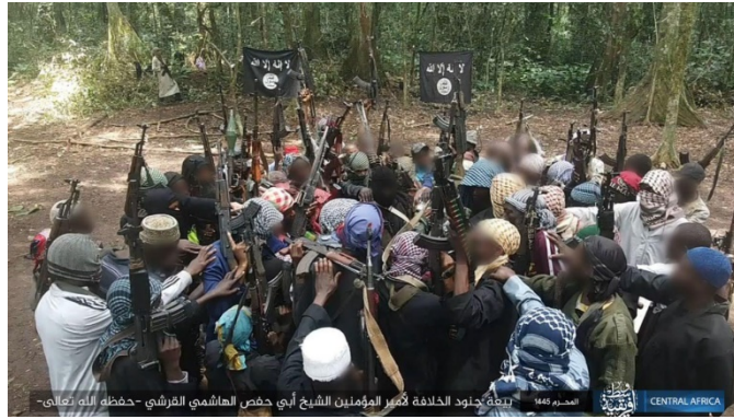
Operatives of ISIS's Central Africa Province pledge allegiance to the new leader (Telegram, August 8, 2023)