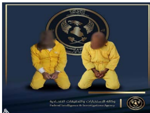
Two ISIS operatives detained in the Kirkuk province (Iraqi News Agency, August 7, 2023)

► On August 7, 2023, the Iraqi security forces detained two ISIS operatives (the exact location was not specified). The two admitted their affiliation with ISIS and their activities in various frameworks within the organization. One of them served in ISIS's morality police (Al-Hisbah) and was responsible for planting IEDs and detonating them in the homes of members of the Iraqi security forces. The other took part in the fighting against the Kurdish Peshmerga forces (Iraqi News Agency, August 7, 2023).