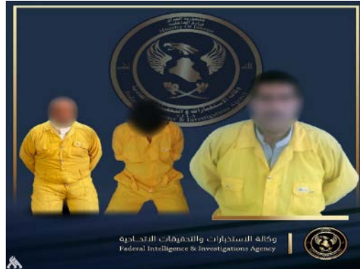
The three ISIS operatives detained in Baghdad (Iraqi News Agency, August 6, 2023)

► On August 6, 2023, Iraqi intelligence teams detained three wanted ISIS operatives in the city of Baghdad. The three admitted their affiliation with the organization (Iraqi News Agency, August 6, 2023).