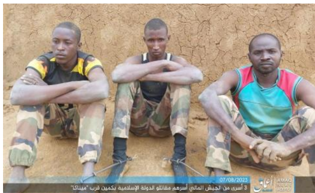
The three abducted Malian soldiers (Telegram, August 7, 2023)

responsibility for the attack, noting that it had ambushed a military convoy and that 13 Malian soldiers were killed and three others were abducted (Telegram, August 7, 2023).