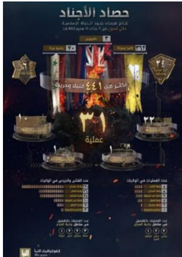
Summary of ISIS attacks (Al-Naba weekly, Telegram, August 3, 2023)