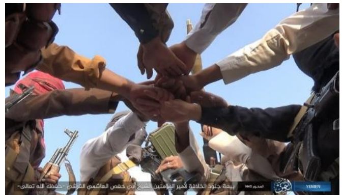
Operatives of ISIS's Yemen Province (right) and ISIS's Al-Sahel Province (left) pledge allegiance to the new leader (Telegram, August 7, 2023)