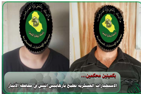
Two ISIS operatives detained in Al-Anbar Province (SecMedCell Facebook page, July 28, 2023)

► On July 28, 2023, an Iraqi Military Intelligence force detained two ISIS operatives (the exact location was not specified) (SecMedCell Facebook page, July 28, 2023).