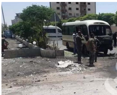
Right: The scene of the attack (Akhbar al-Shia, July 25, 2023); Left: The bus that was hit (@FA6969Di Twitter account, July 25, 2023)

◆ On July 27, 2023, a motorcycle bomb was detonated near a taxi on Kou' al-Sudan Street, opposite the Sayyidat al-Sham Hotel. Six people were killed and 23 others were wounded (SANA, July 27, 2023). Two days later, the death toll reportedly rose to ten. Five children, a woman, a man, a member of the security forces, and two non-Syrians were killed (Syrian Observatory for Human Rights, July 29, 2023).