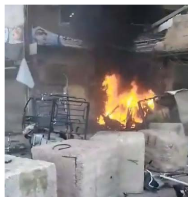
Right: The scene of the attack. Left: The wreckage of the vehicle

► On July 28, 2023, ISIS issued an announcement claiming responsibility for the two attacks in Al-Sayyida Zaynab, in which, according to ISIS, a motorcycle bomb was detonated near a bus carrying Shiite pilgrims and near a taxi. At the end of its statement, ISIS threatened, “Let the objectionists [i.e., Shiites] know that our war against them continues everywhere” (Telegram, Amaq, July 28, 2023).