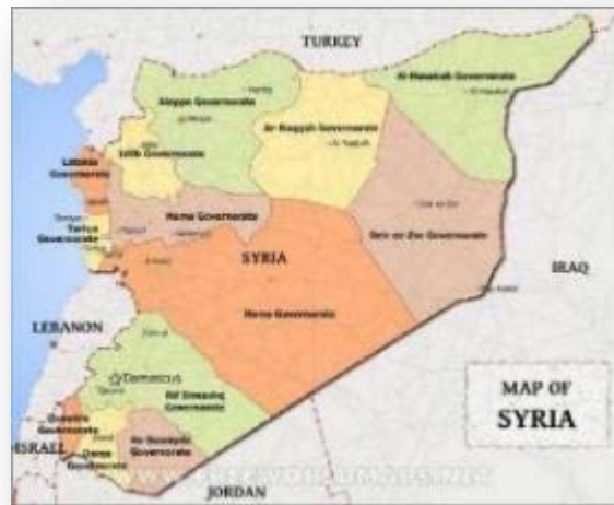
Provinces of Syria (Free World Maps)