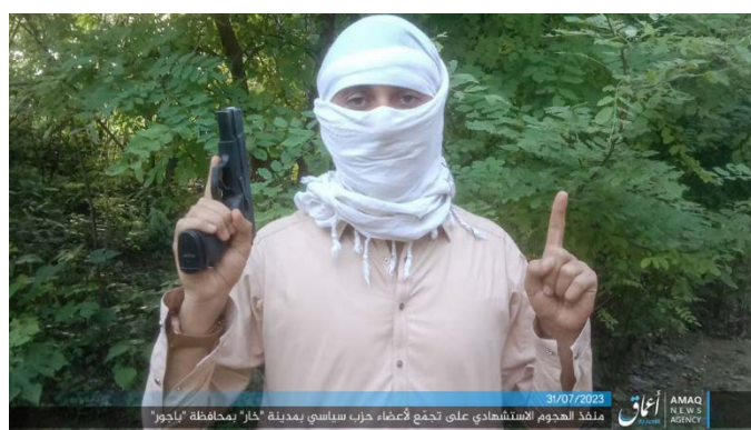
The terrorist who carried out the suicide bombing attack (Amaq, Telegram, July 31, 2023)