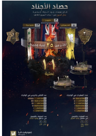
Summary of ISIS attacks (Al-Naba weekly, Telegram, July 27, 2023)

Central Africa (3); Pakistan (1); and Somalia (1) (Al-Naba weekly, Telegram, July 27, 2023). This represents a moderate decline in ISIS’s activity around the world.