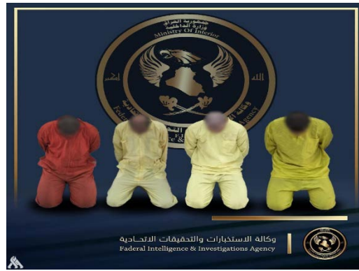
The four ISIS operatives detained in the Nineveh Province (Iraqi News Agency, July 27, 2023)