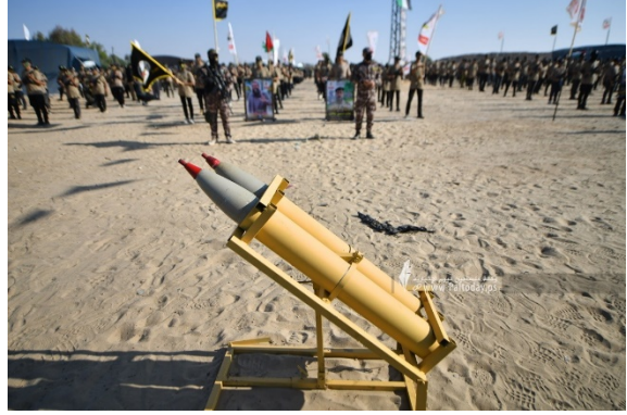
Displays at the final ceremony (Paltoday, June 22, 2023).