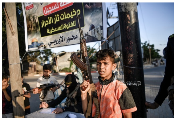
Camp registration at the recruiting unit's site in Khan Yunis in the southern Gaza Strip.

► The camps lasted for about two weeks and were held simultaneously at Jerusalem Brigades military facilities in the northern Gaza Strip, Gaza City, the central Gaza Strip, Khan Yunis and Rafah. Registration was open to adolescents 14, 15 and 16 years of age. According to the organizers, their objective was to provide them with the comprehensive military and ideological tools they would need to join the Jerusalem Brigades' ranks. Apparently, their instructors were Jerusalem Brigades terrorist operatives, who were photographed with their faces masked.