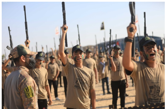
Armed campers. Their instructors are masked.