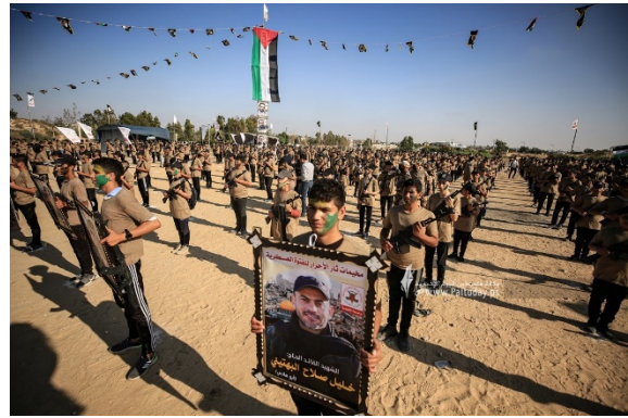
The final ceremony.