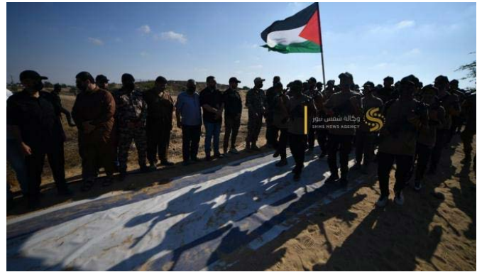
At the entrance to the camp participants walk to the site of the final ceremony on an Israeli flag (Right: Paltoday, June 22, 2023. Left: Shams News, June 22, 2023).