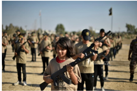
Two very young armed children. The guns are real.