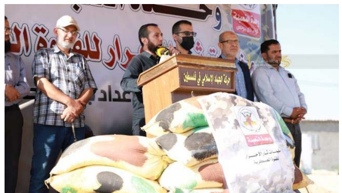
The speakers at the final ceremony (Shams News, June 22, 2023).