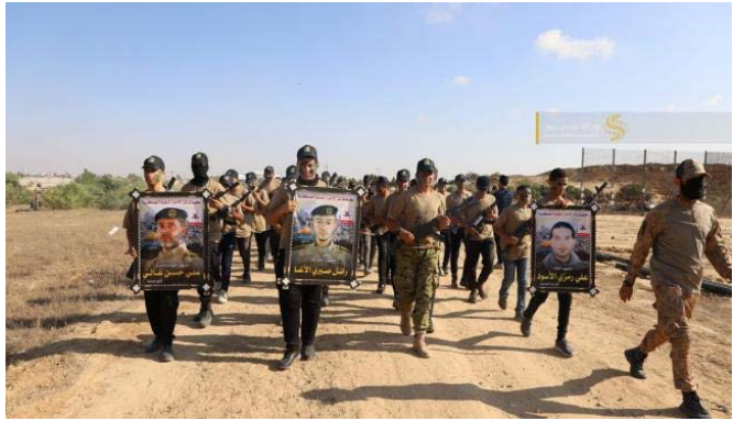
Right: Camp participants marching with pictures of shaheeds (Paltoday, June 22, 2023). Left: Camp participants marching with arms (Jerusalem Brigades website, June 23, 2023).