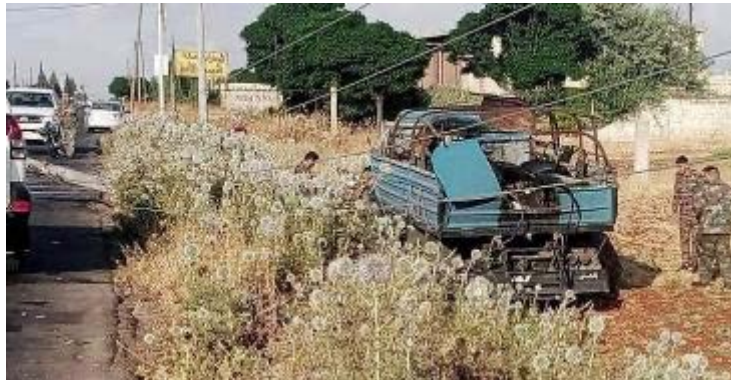
The vehicle hit by the IED, on the side of the road (Al-Modon, June 18, 2023)

► On June 18, 2023, an IED was activated against a military vehicle transporting soldiers near the Al-Jabiriyah junction, on the Al-Mushrefa road, about 10 km northeast of Homs. Three Syrian soldiers were killed and six others were wounded. So far, no organization has claimed responsibility for the attack. However, ISIS was apparently behind it (Al-Modon, June 18, 2023; Al-Badia 24, June 18, 2023).