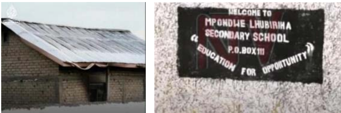
The entrance to the school and a burnt residential building following the attack (Al-Jazeera, June 17, 2023)

the eastern Democratic Republic of Congo. In 2019, many ISIS operatives pledged allegiance to the leader of ISIS and became part of the organization's Central Africa Province (DW and The Independent, June 17, 2023; the-star.co.ke, June 18, 2023). It should be noted that this is an organization that frequently attacks Christian citizens and military personnel, especially in the territory of the Democratic Republic of Congo, with Uganda serving as a place of refuge for the organization's operatives.