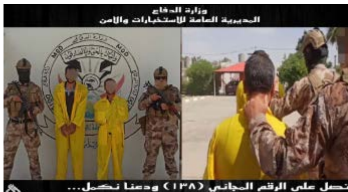
Two ISIS commanders detained in the Kirkuk Province

► On June 16, 2023, teams of Kirkuk's General Directorate of Intelligence and Security, which operates within the Iraqi Ministry of Defense, detained two wanted men. One of them is an ISIS commander in charge of the organization's medical services in the province, and the other is a prominent commander who is the brother of ISIS's war minister.