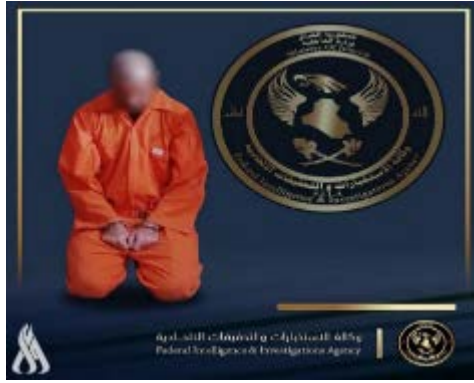
ISIS's legal authority in the Salah al-Din area