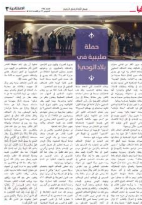
The editorial “Crusade in the Lands of Revelation” (Al-Naba weekly, Telegram, June 15, 2023)