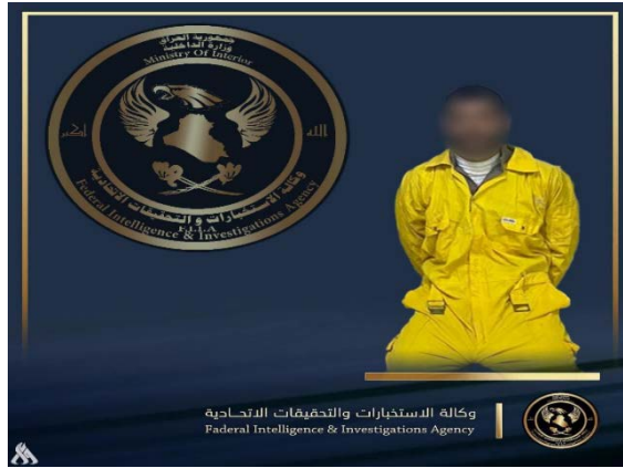
ISIS's commander (Wali) in charge of Tal Afar, detained by Iraqi intelligence