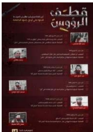
Summary of ISIS's assassinations of senior Taliban officials (Al-Naba weekly, Telegram, June 15, 2023)