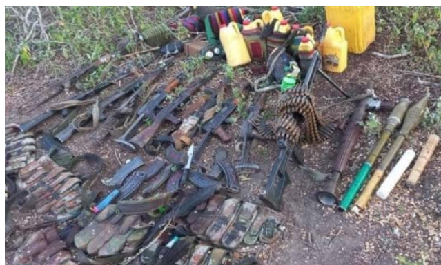
Weapons and ammunition found in the possession of Al-Shabaab operatives (Somalia News Agency, June 20, 2023)

► On June 20, 2023, a Somali army force operated against Al-Shabaab operatives near Yaaqdabayl, southwest of Mogadishu. Thirteen Al-Shabaab operatives were killed. Seven assault rifles, a rocket launcher, and a machine gun were also found at the site (Somalia News Agency, June 20, 2023).