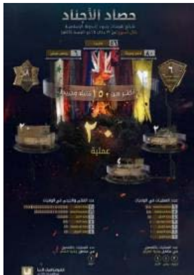
Summary of ISIS attacks (Al-Naba weekly, Telegram, June 15, 2023)

► According to an infographic published by ISIS's weekly Al-Naba, summarizing ISIS's activity on June 8-14, 2023, ISIS operatives carried out 20 attacks in the various provinces during this period (compared with 22 in the previous week). The Central Africa Province carried out the highest number of attacks (6). Attacks carried out in the other provinces: West Africa (5); Iraq (4); Mozambique (2); Khorasan, i.e., Afghanistan (1); Somalia (1); and Syria (1). A total of 150 people were killed and wounded in the attacks, compared with 85 in the previous week. The largest number of casualties was in the Khorasan, i.e., Afghanistan, Province (70); Central Africa (56); Iraq (11); Syria (5); West Africa (4); and Somalia (4) (Al-Naba weekly, Telegram, June 15, 2023).