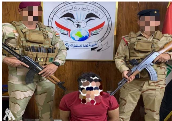
ISIS operative detained by Iraqi intelligence

► On June 19, 2023, members of the General Directorate for Intelligence and Security in the Iraqi Ministry of Defense, in coordination with the staff of the National Security Apparatus, detained a highly wanted ISIS operative in the Tikrit district, about 150 km north of Baghdad.