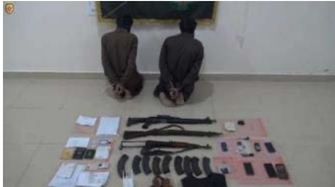
Two ISIS operatives and equipment found in their possession (SDF Press, June 16, 2023)

ammunition to carry out terrorist attacks against the SDF forces and civilians. Weapons and military equipment were found in the possession of the detainees (SDF Press, June 16, 2023).