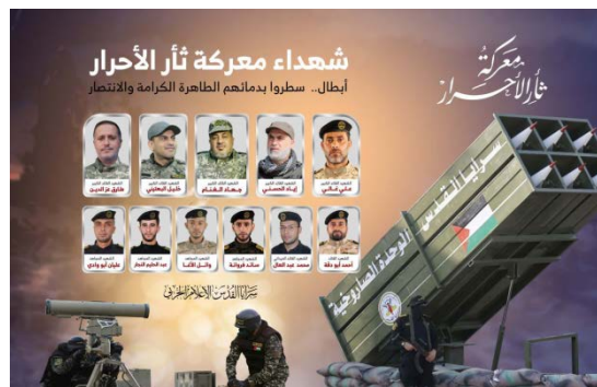
The names of the operatives killed according to the PIJ (Jerusalem Brigades' Telegram channel, May 14, 2023).