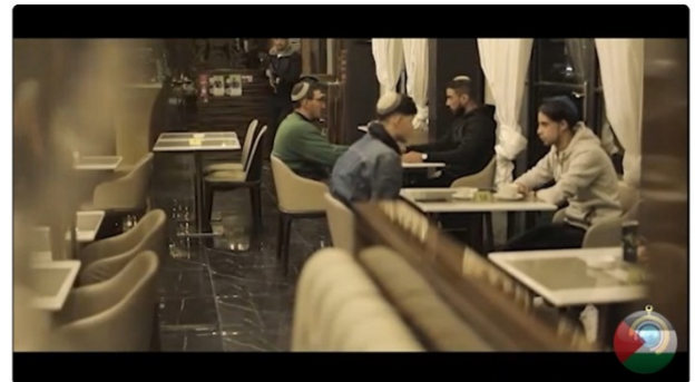
19 المسلسل الوثائقي درب الفداء الحلقة HD Full

Right: Picture from Episode 19 of "The path of sacrifice" (seraj.tv, April 12, 2023). Left: Picture the restaurant from a "wolf" video, April 8, 2023.