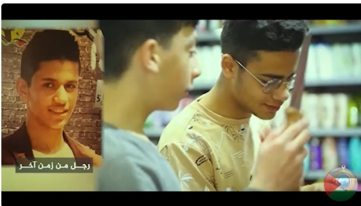
المسلسل الوثائقي درب الفداء الحلقة 22 HD Full