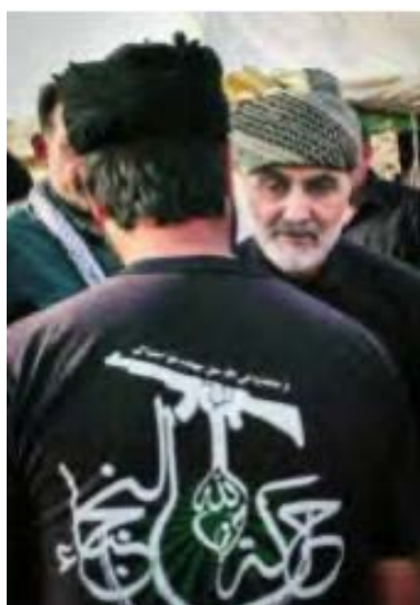
Qassem Soleimani, former commander of the IRGC's Qods Force, alongside a Nujaba Movement fighter in the Albukamal region in Syria in 2017

► To recruit fighters to its ranks in Syria , for the first time in April 2021, the Nujaba Movement opened a recruitment office in the town of Al-Sabkha, about 25 km southeast of Al-Raqqah, in an area controlled by the Syrian army. It was reported that the recruits would receive a monthly salary of up to 250,000 Syrian pounds (about $100). It seems that the militia tried to take advantage of the difficult economic situation that prevailed in the region