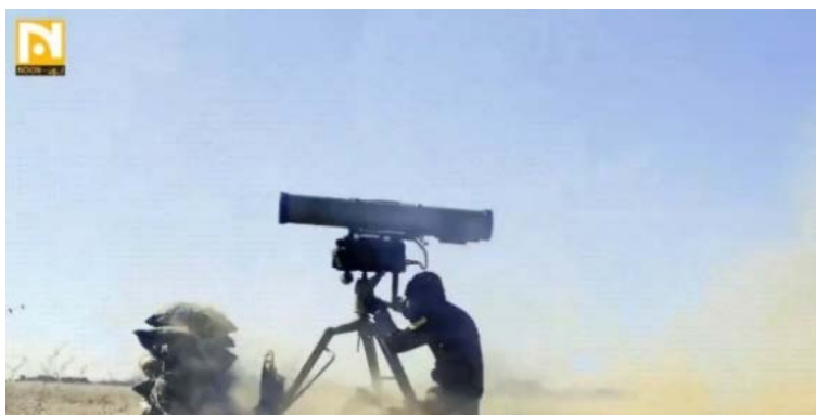
Anti-tank missile launch (Nujaba Movement's Twitter account, June 24, 2022)

◆ Russian-made Kornet anti-tank missiles (Nujaba Movement's Twitter account, June 24, 2022).