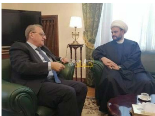
Al-Kaabi meeting with Bogdanov in Moscow (Jehad Brothers Team Telegram channel, November 26, 2022)

► Apparently, following the rapprochement between Iran and Russia over the past year, against the backdrop of the war in Ukraine, Al-Kaabi met with Mikhail Bogdanov, deputy foreign minister of Russia and Russian President's special envoy to the Middle East and Africa. Al-Kaabi briefed him on security and political issues, stressing the need not to allow the United States to leave forces in Iraq and "steal its treasures." Bogdanov praised the Nujaba Movement's role in the fight against ISIS in Iraq and Syria and stressed the need to strengthen ties with Iraq at all political, economic, and cultural levels (Jehad Brothers Team Telegram channel, November 26, 2022).