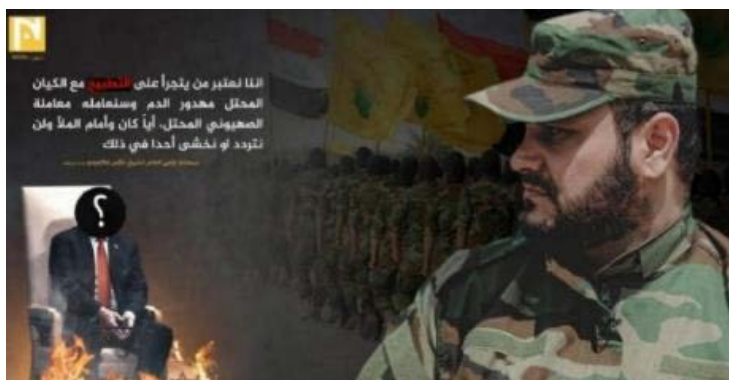
Al-Kaabi threatens to act against anyone who normalizes relations with Israel (the Nujaba Movement’s Twitter account, July 15, 2022)

► Addressing the Saudi announcement in July 2022 that the airspace above Saudi Arabia would be opened to Israeli planes, Al-Kaabi noted that they regard anyone who dares to normalize relations with Israel (the “occupying entity”) as fair game and will treat him as they do against Israel. A poster shows Al-Kaabi marching with the organization and Iraqi flags against the background of the Nujaba Movement fighters, and the figure of a leader in a suit (whose face was concealed by a question mark) sitting in an armchair, on fire (the Nujaba Movement’s Twitter account, July 15, 2022).