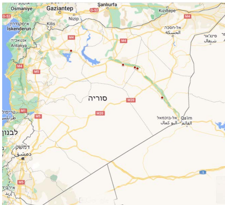
The Nujaba Movement fighters' deployment areas in Syria, in a red circle (Google Maps and web sources)

were supervising the crossing. It was noted that the border crossing is used by Iranian and Iraqi militias for smuggling purposes (Baladi, March 25, 2022).