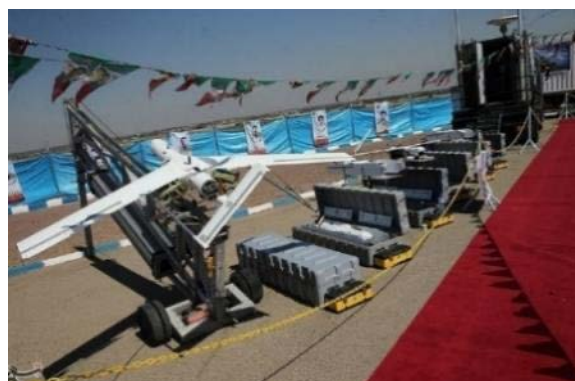
Iranian Yasser observation drone