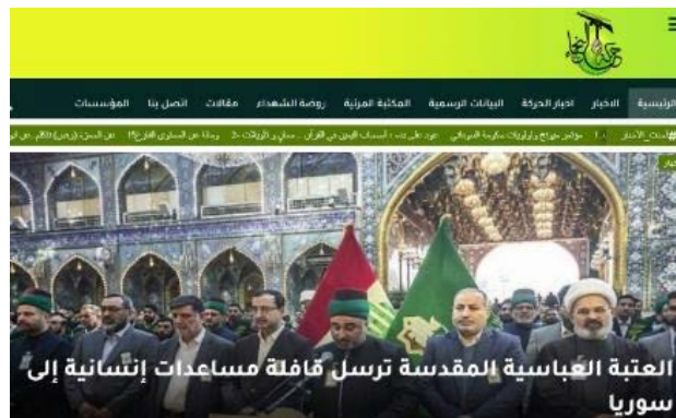
Nujaba Movement’s website (February 23, 2023)