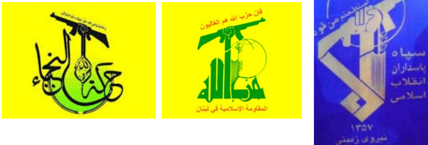
From left to right: The Nujaba Movement’s emblem, Hezbollah’s emblem, and the Qods Force’s emblem (IRNA News Agency, November 7, 2017)

who have believed – indeed, the party of Allah – they will be the predominant.” 19 In addition, each of the three emblems includes the earth, symbolizing the striving for world hegemony.