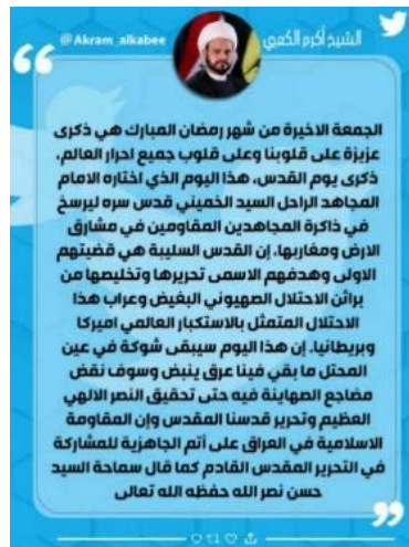
Remarks by the Al-Kaabi on International Jerusalem Day (Akram al-Kaabi’s Twitter account, April 29, 2022)

► On April 29, 2022, Al-Kaabi referred to International Jerusalem Day, established by Ayatollah Khomeini in 1979, which is marked on the last Friday of Ramadan. According to Al-Kaabi, Jerusalem is the first and foremost issue and it must be conquered and saved from Israel (“the Zionist enemy”). Al-Kaabi wished for the destruction of Israel and noted that his movement was fully ready to participate in the “holy liberation” [of Jerusalem] (Akram al-Kaabi’s Twitter account, April 29, 2022).