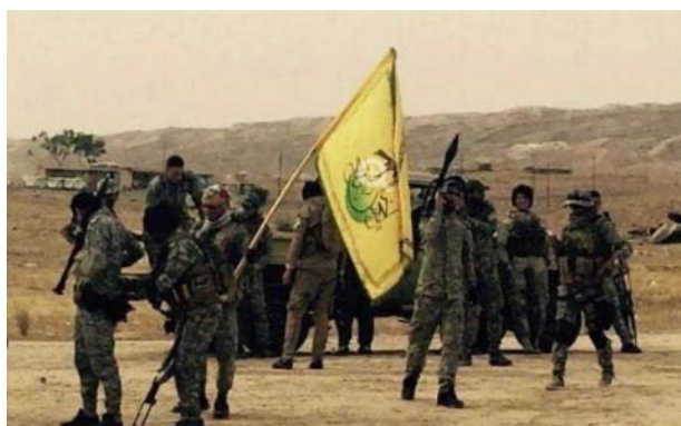
Nujaba Movement fighters (Al-Marja', August 13, 201)