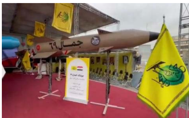
Jamal 69 ballistic missile

◆ On April 29, 2022, the International Jerusalem Day march was held in Tehran. At the same time, a weapons exhibition was held, displaying missiles, cruise missiles, and rockets, including the Nujaba Movement's new Jamal 69 ballistic missile (Fars, April 29, 2022). This solid-fuel ballistic missile has a range of 700 km and carries a warhead weighing 450 kg. The missile was named Jamal after Abu Mahdi al-Muhandis, PMF's deputy commander (who was killed in January 2020). The number 69 is derived from the numerical value of the name Zaynab, Prophet Muhammad's granddaughter (Arab Journal, August 28, 2022).