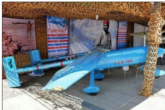
Ababil-3 UAV (Wikipedia)

speed of about 200 km/h, and a cruising altitude of about 5 km (Syrian Observatory for Human Rights, July 17, 2022; Fars, August 11, 2019).