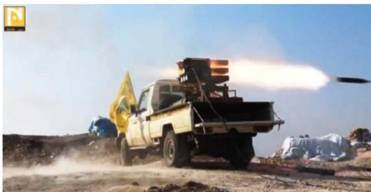
107mm rocket being launched from a multi-barrel launcher carried on an off-road vehicle (Nujaba Movement's Twitter account, June 11, 2022)

◆ The militia also has short-range 107mm rockets launched from multi-barrel launchers (12 barrels) carried on the organization's off-road vehicles (Nujaba Movement's Twitter account, June 11, 2022). Apparently, these rockets are Iranian-made or self-manufactured under Iranian guidance.