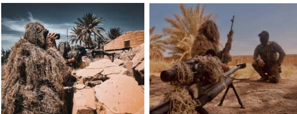
Right: Sniper carrying a sniper rifle, and next to him a large-caliber sniper rifle (Nujaba Movement's Twitter account, June 17, 2022). Left: Sniper pointing a sniper rifle with a lookout next to him (Nujaba Movement's Twitter account, June 17, 2022)

► Sniper rifles: The militia has a sniper unit using sniper rifles of various calibers, apparently made in Iran (Nujaba Movement's Twitter account, June 17, 2022).