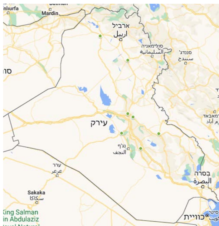
Nujaba Movement fighters' deployment areas in Iraq, marked in green (Google Maps and Internet sources)