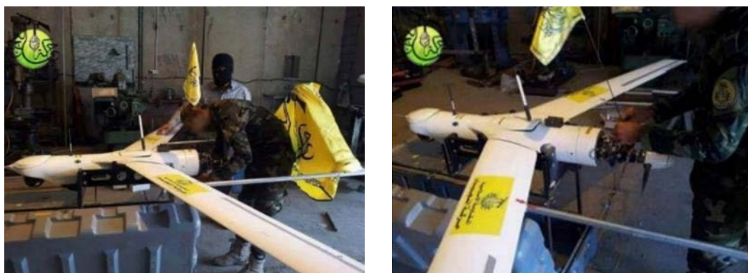
Iranian Yasser observation drone with the Nujaba Movement's logo

► Surface-to-surface missiles, ballistic missiles, and rockets: It is reasonable to assume that all types of missiles used by the militia are made in Iran.