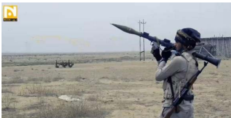
Nujaba Movement fighter carrying a launcher armed with a rocket (Nujaba Movement's Twitter account, June 24, 2022)

► Sniper rifles: The militia has a sniper unit using sniper rifles of various calibers, apparently made in Iran (Nujaba Movement's Twitter account, June 17, 2022).