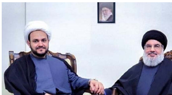
Al-Kaabi meets with Nasrallah (NAS, August 13, 2019)