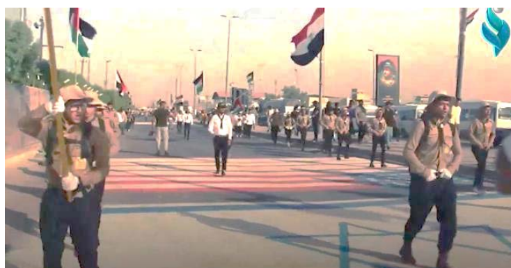
Right: Young members of the youth movement walking over Israeli and American flags (the militia’s Facebook page, March 9, 2023). Left: Youth movement at a ceremony commemorating Qassem Soleimani and Abu Mahdi al-Muhandis (the militia’s Facebook page, January 7, 2023)