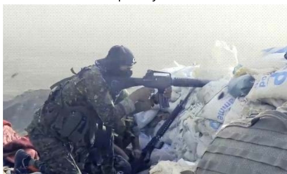
Nujaba Movement fighter shoots an M-16 (Nujaba Movement's Twitter account, June 24, 2022)

► M-16 rifle made in the USA: A very small part of the militia fighters have M-16 rifles made in the United States. It seems that the rifles reached the militiamen through the Iraqi Army (Nujaba Movement's Twitter account, June 24, 2022). Additional US Army equipment may have reached the militiamen from the Iraqi Army.