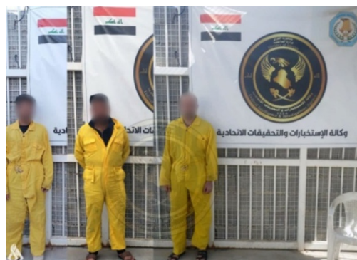
The three ISIS operatives who were arrested (Iraqi News Agency, March 27, 2023)

► On March 27, 2023, the Federal Intelligence and Investigations Agency, which operates within the framework of the Iraqi Ministry of Interior, announced the arrest of three wanted ISIS operatives on suspicion that they had provided logistical assistance to ISIS operatives in the Diyala Province and passed on information about the movements of the Iraqi security forces in the province (Iraqi News Agency, March 27, 2023).