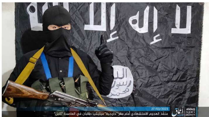
The terrorist who carried out the suicide bombing attack (Telegram, March 27, 2023)

diplomats and security guards who exited the building. According to ISIS, about 20 people were killed or wounded in the explosion, including diplomats. ISIS said that this was the second suicide bombing attack carried out against the Taliban Foreign Ministry. The first attack was carried out on January 11, 2023, in which 20 people were killed 5 (Amaq, Telegram, March 27, 2023).