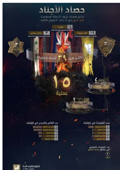
Summary of ISIS attacks (Al-Naba weekly, Telegram, March 23, 2023)

► An infographic published by ISIS's Al-Naba weekly, summing up ISIS's activity around the globe on March 16-22, 2023, indicates that the organization carried out 15 attacks in its various provinces (compared to 18 in the previous week). The largest number of attacks was carried out by the West Africa Province (8). Attacks carried out in the other provinces: Iraq (2); Khorasan, i.e. Afghanistan (2); Central Africa (2); and Mozambique (1). A total of 39 people were killed and wounded in the attacks, compared to 191 in the previous week. The largest number of casualties was in the West Africa Province (14). The other casualties were in the following provinces: Central Africa (13); Iraq (6); Khorasan (Afghanistan) (5); and Mozambique (1) (Al-Naba weekly, Telegram, March 23, 2023).