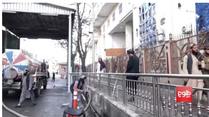
The suicide bombing attack near the Ministry of Foreign Affairs building in Kabul (TOLO News YouTube channel, March 28, 2023)

► ISIS claimed responsibility for the attack. According to its statement, a suicide bomber codenamed Abdel Hamid al-Khorasani (i.e., from Afghanistan) arrived on March 27, 2023, near the main entrance of the Ministry of Foreign Affairs building in central Kabul. He activated his explosive belt near a checkpoint against Foreign Ministry employees, including