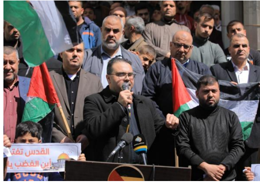
Hazem Qassem speaking during a march in Khan Yunis ( Hamas website, March 17, 2023)