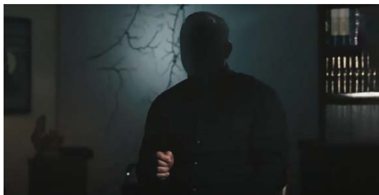
Blurred picture of Marwan Issa attached to statements made to al-Aqsa TV (Hamas website, March 15, 2023)