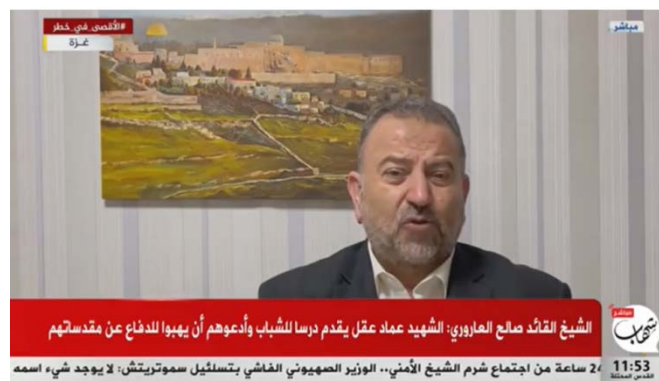
Saleh al-'Arouri