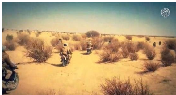
Operatives of ISIS’s Sahel Province setting out to attack Al-Qaeda in Mali (Telegram, March 20, 2023)