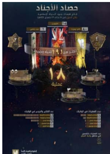
Summary of ISIS attacks (Al-Naba, Telegram, March 16, 2023)

► An infographic published by ISIS's Al-Naba weekly, summing up ISIS's activity around the globe on March 9-15, 2023, indicates that the organization carried out 18 attacks in its various provinces (compared to 19 in the previous week). The largest number of attacks was carried out by the West Africa Province (9). Attacks carried out in the other provinces: Central Africa (5); Khorasan, i.e. Afghanistan (2); Iraq (1); and Mozambique (1). A total of 191 people were killed and wounded in the attacks, compared to 76 in the previous week. The largest number of casualties was in the Central Africa Province (109). The other casualties were in the following provinces: West Africa (45); Khorasan (Afghanistan) (34); Mozambique (2); and Iraq (1) (Al-Naba weekly, Telegram, March 16, 2023). It should be noted that over half of the fatalities were Christian civilians murdered in villages in the Beni region, in the eastern Democratic Republic of the Congo.