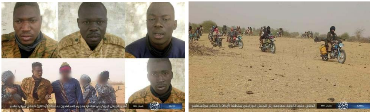
Right: ISIS operatives setting out for the attack. Left: The five soldiers taken prisoner (Telegram, February 25, 2023)

in the Burkina Faso-Mali-Niger border triangle. 3 According to ISIS, about 70 soldiers were killed and several dozens were wounded. Five were taken prisoner. In addition, ISIS operatives seized one Burkina Faso army vehicle, 27 motorcycles, and a wide range of weapons and ammunition. Photographs published by ISIS’s Amaq News Agency show about 50 bodies of Burkina Faso soldiers, the captives who were kidnapped, and what ISIS seized in the attack. Yet another announcement, by ISIS’s Sahel Province, stated that “the armies of the apostates in the Sahel region must know that the war against them will continue until Islamic law, Sharia, is implemented in the country” (Telegram, February 25, 2023).