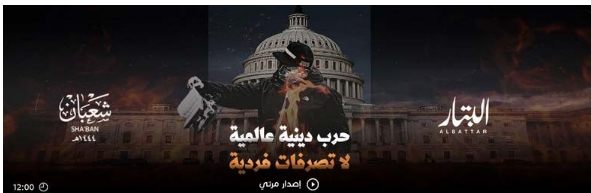
The opening screen of the video (Telegram, February 24, 2023)

► The opening of the video in French could perhaps imply that it was produced in a French-speaking country. The choice of the title of the video, “Global religious war - not individual conduct,” was intended to encourage an extensive campaign and not sporadic actions, perhaps due to the fact that until now the call to carry out terrorist attacks against Christians has not led to any response by ISIS operatives and supporters.