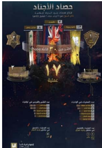
Summary of ISIS attacks (Al-Naba, Telegram, February 23, 2023)

should be noted that the summary does not include the attack carried out by the Sahel Province against the Burkina Faso army on February 17, 2023, in which about 70 soldiers were killed (see below).