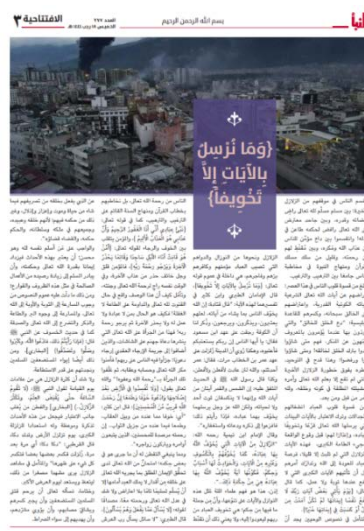
Right: The article about the earthquake. Left: The infographic entitled “Earthquakes” (Telegram, February 9, 2023)