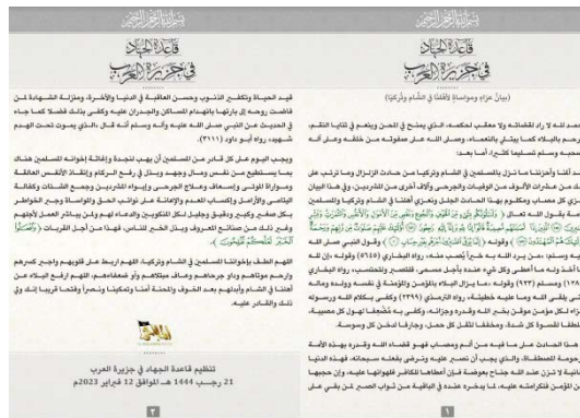
The announcement of Al-Qaeda’s Al-Malahem media wing (Telegram, February 12, 2023)

► On February 12, 2023, Al-Malahem, Al-Qaeda in the Arabian Peninsula (AQAP)’s media wing, published a statement in which it expresses solidarity with the victims of the earthquake and calls for the provision of assistance to the victims in any possible way, such as providing material assistance, helping to remove the ruins, sending the wounded to the hospitals, caring for orphans and widows, and providing shelter for the homeless (Telegram, February 12, 2023). This indicates that Al-Qaeda is also trying to take advantage of the circumstances to gather support.