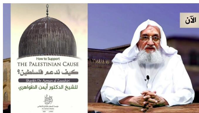
The slide with Al-Zawahiri’s photo that accompanies the video (Telegram, February 12, 2023)