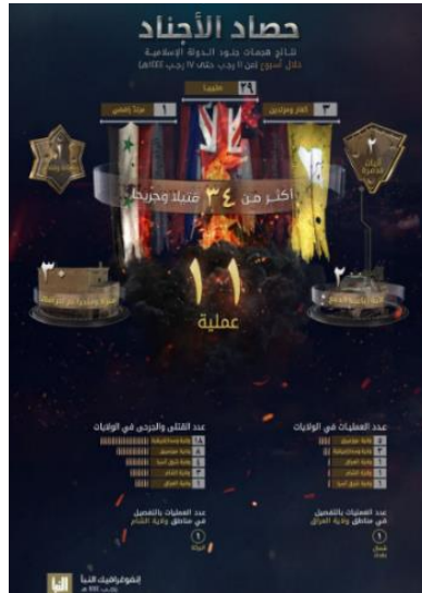
Summary of ISIS’s attacks (Al-Naba, Telegram, February 9, 2023)