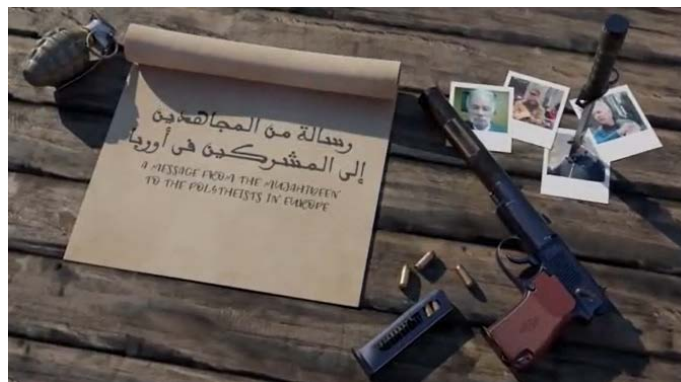
The beginning of the video (Telegram, January 31, 2023)

► On January 31, 2023, Sarh al-Khilafah Media Foundation, which is affiliated with ISIS, published a short video (about two minutes), entitled “A message from jihad fighters to polytheists in Europe.” It includes a recording of Osama bin Laden, the former leader of Al-Qaeda, who is a “role model” also for ISIS operatives, in which he threatened European countries with retaliatory actions in view of the publication of offensive cartoons against Muhammad (a threat bin Laden made in 2006, following the publication of 12 offensive cartoons against Muhammad in a Danish satirical newspaper). Bin Laden stated in the recording that the publication of the offensive cartoons constitutes an extremely serious offense and that the retribution would be even harsher. The video was published with subtitles in English and Arabic and photos from the scenes of attacks carried out by ISIS in Europe over the years (Telegram, January 31, 2023).