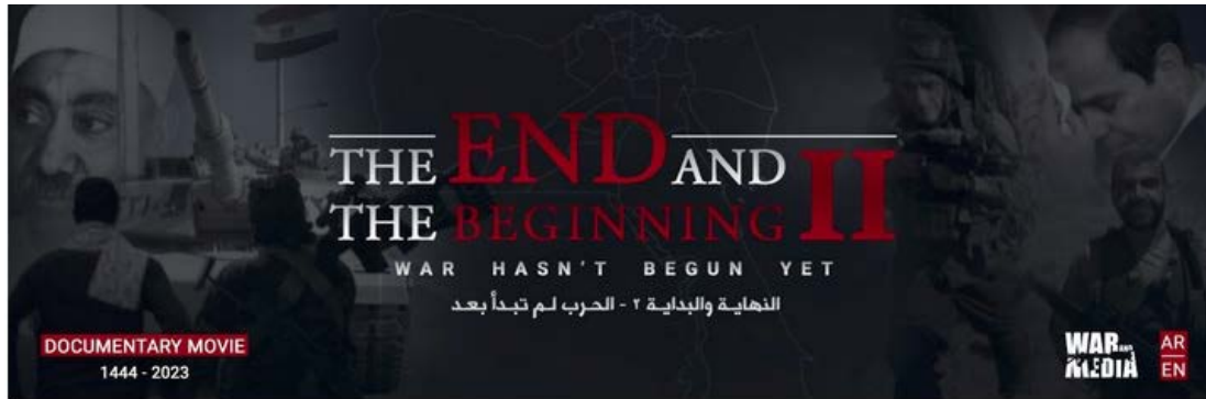
The beginning of the video (Telegram, January 29, 2023)