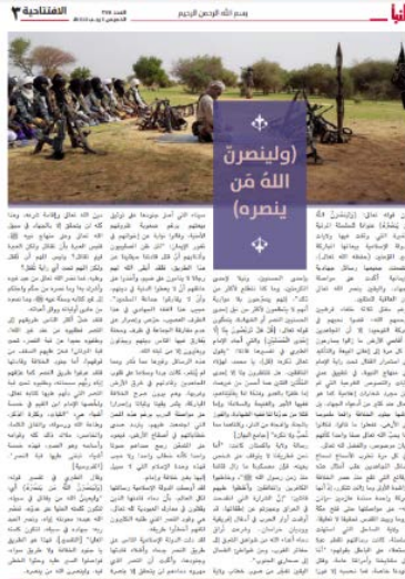
The editorial “Allah helps those who help Him [i.e., supports His religion]” (Al-Naba, Telegram, January 25, 2023)