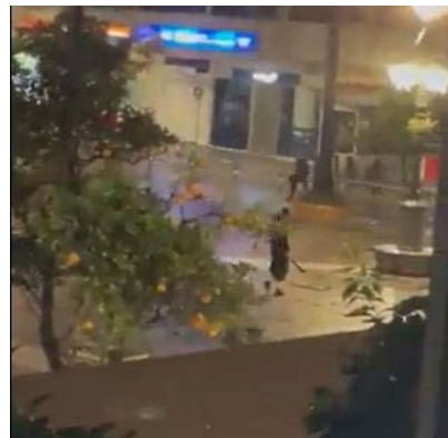
The perpetrator with a machete seen on a security camera (Telegram, January 25, 2023)