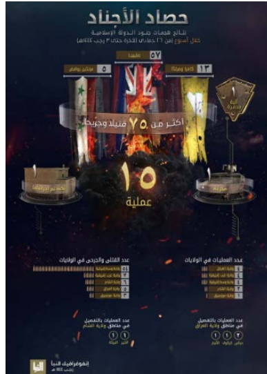
Summary of ISIS’s attacks (Al-Naba, Telegram, January 25, 2023)

casualties was in the West Africa Province (54). The other casualties were in the following provinces: West Africa (7); Syria (6); Iraq (5); and Mozambique (3) (Al-Naba weekly, Telegram, January 25, 2023).