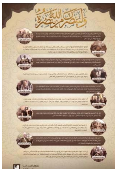
The infographic entitled “Allah helps those who help Him [i.e., support His religion]” (Al-Naba, Telegram, January 25, 2023)