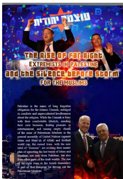
The article in the Voice of Khurasan magazine (Telegram, January 15, 2023)

►The Minister of Finance, Bezalel Smotrich, is mentioned as another extreme figure. According to the author, both are considered extreme even in the eyes of the Zionist right. In this way, the author tries to portray the two as representatives of the extreme nature of the current Israeli government. The author also points out that the majority of young people in Israel support both, which indicates the extreme nature of Israeli society. The detailed preoccupation with the intricacies of Israeli politics can testify to the growing interest on the part of ISIS in Israel.