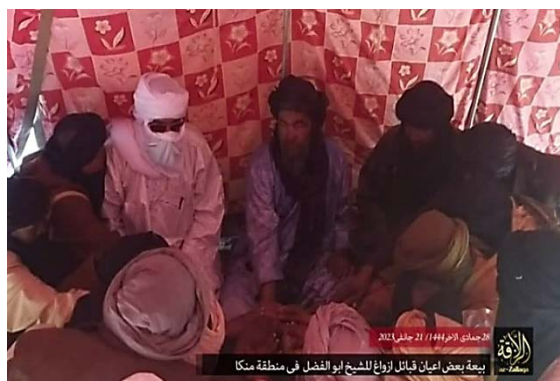
Tribe leaders pledging allegiance (Telegram, January 23, 2023)

Mali pledging allegiance to the organization leader, Iyad Ag Ghali, codenamed Abu al-Fadl (The Long War Journal, January 23, 2023).