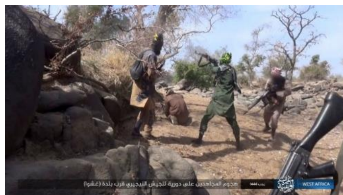
ISIS operatives shooting at a Nigeria army patrol (Telegram, January 24, 2023)