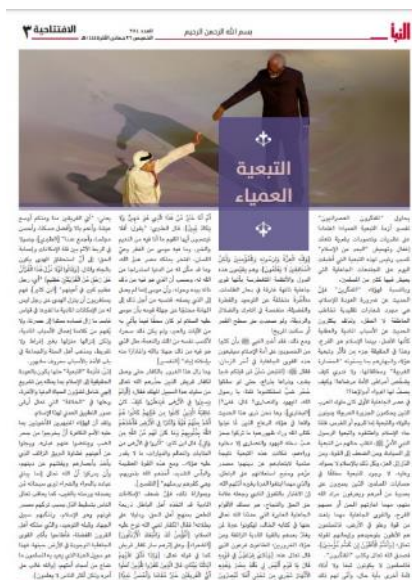
The editorial “Blind Subordination” (Al-Naba, Telegram, January 19, 2023)

► It should be noted that the photo that appears at the top of the article is from the opening ceremony of the World Cup held on November 20, 2022, in Qatar, where American actor Morgan Freeman appears next to a local disabled person with amputated legs, in a way that expresses tolerance and acceptance of the other. In the current context, however, the photo comes to symbolize the inferiority of the Muslims and their subordination to the West.