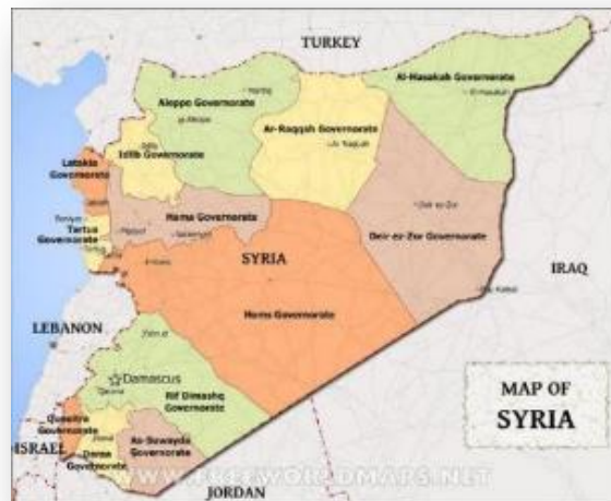
Map of Syria’s provinces