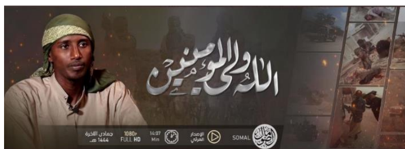
ISIS operative in the video (Telegram, January 21, 2023)

► On January 21, 2023, ISIS's Somalia Province released a video under the title "God is the Protector of the Faithful," in which it documents operations carried out by the province against the security forces of Somalia and joint forces of the government of Somalia and the United States Army in the northeast of the country. In the video, an operative of the province appears with his face visible. He calls on the prisoners of the organization to be patient and know that the organization has not forgotten them and is working for their release. He calls on the organization's operatives to fight their enemies. In addition, he calls on the United States to stop its activity against Muslims which has been going on for more than two decades, since it has achieved nothing except the destruction of its economy. He threatens the Somali government and its supporters, stating that a new phase of harming them has begun, one that they have not known until now (Telegram, January 21, 2023). The video was published in view of the intensification of the conflicts between the Somali government and the jihadist elements in the country, led by Al-Shabaab.