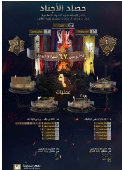
Summary of ISIS’s attacks (Al-Naba, Telegram, January 19, 2023)