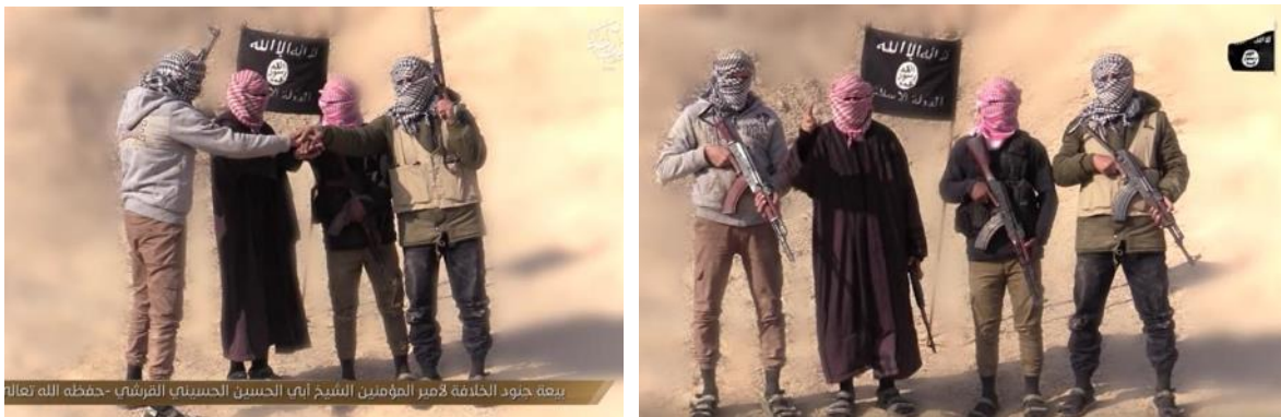
The speaker in the video concludes and then the four pledge allegiance to ISIS’s new leader (Telegram, January 18, 2023)

◆ A pledge of allegiance: At the end of the video, four operatives pledge allegiance to ISIS’s new leader Abu Hussein al-Husseini al-Qurashi. It should be noted that this pledge of allegiance was published long after the operatives of the organization’s other provinces around the globe published their pledges of allegiance. This may indicate communication difficulties and perhaps even functional difficulties in the province’s media system.