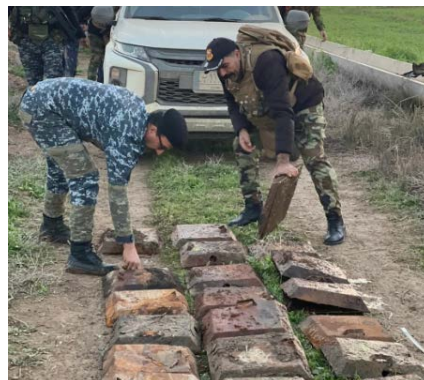
Some of the IEDs that were found

► An Iraqi intelligence force operating in the Hawija district, southwest of Kirkuk, detained an ISIS female operative who served in a high-ranking position in ISIS's morality police (Al-Hisba) in the Kirkuk Province (SecMedCell Facebook page, January 14, 2023).