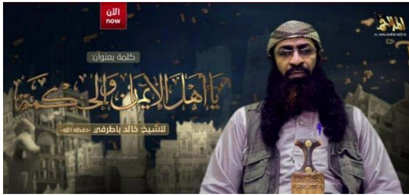
AQAP leader Khalid Batarfi on the slide that accompanies the audiotape (Telegram, January 14, 2023)