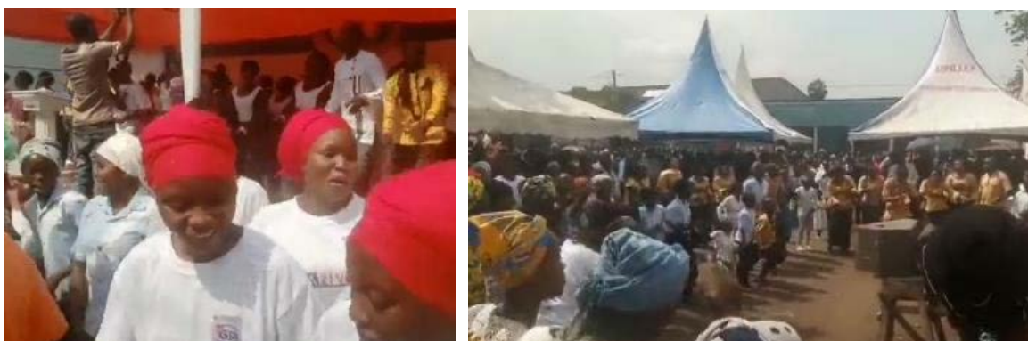
Christian citizens in the church courtyard a few minutes before the IED was set off (Georges Kisando Sokomeka Twitter account, January 16, 2023)

► On January 15, 2023, an IED was set off in a church courtyard in the city of Kasindi, in northeastern Congo, about 2.5 km west of the Congo-Uganda border. At the time, hundreds of people gathered there for baptism ceremonies. Fourteen people were killed (Reuters, January 17, 2023). According to a local report, over 50 were wounded, including 35 women, 15 men, and three children (Beninipashe, January 17, 2023).