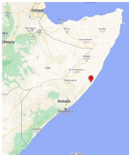
The port city of Harardhere

► Somali Minister of Defense Abdulkadir Mohamed Nur Jama announced that Somalia's security forces had taken over the port city of Harardhere, about 400 km northeast of Mogadishu. The city was controlled by Al-Shabaab and was one of the organization's most important strongholds. In addition, the forces took control of the nearby town of Galcad (Reuters, January 16, 2023). This is a severe blow for Al-Shabaab, in terms of damage to its supply routes as well as damage to the morale of its operatives.