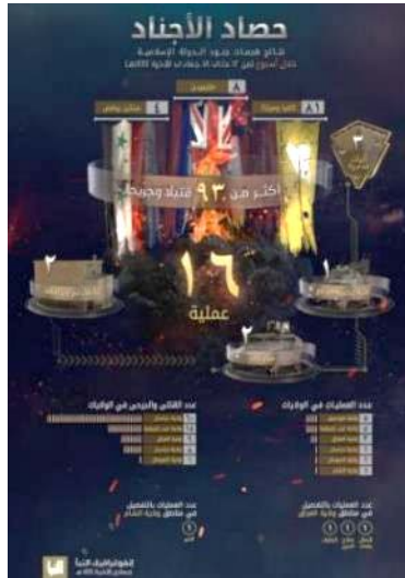
Summary of ISIS’s attacks (Al-Naba, Telegram, January 12, 2023)

largest number of casualties was in the Khorasan (i.e., Afghanistan) Province (60). The other casualties were in the following provinces: West Africa (15); Iraq (9); Syria (8); and Somalia (1) (Al-Naba weekly, Telegram, January 12, 2023).