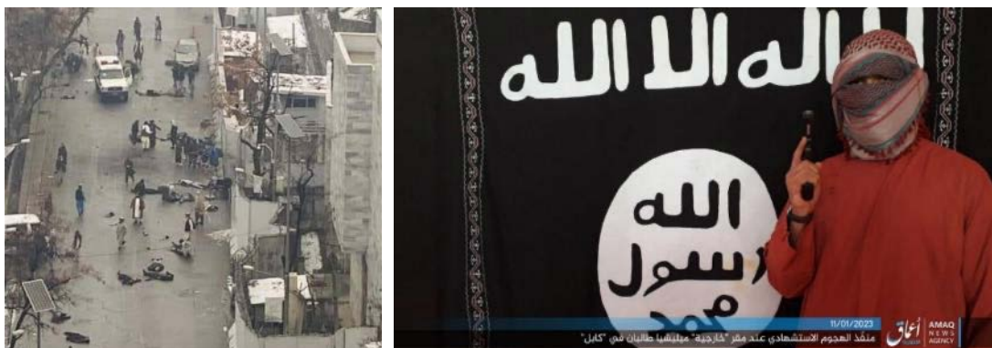
The ISIS operative who carried out the attack, near the scene of the attack (Amaq, Telegram, January 11, 2023; Telegram, January 11, 2023; Al-Naba, Telegram, January 12, 2023)

2023 against the Taliban's government institutions. On January 1, 2023, ISIS carried out a suicide bombing attack at the entrance to the military airport in Kabul.