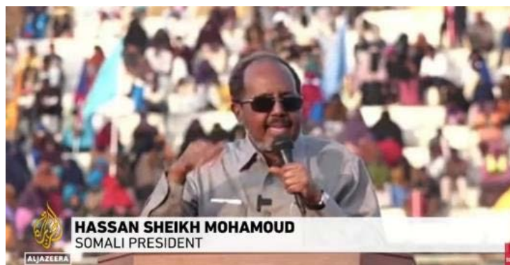
Somali President Hassan Sheikh Mahmoud during the rally (Al-Jazeera, January 13, 2023)

► On January 12, 2023, the Mogadishu police announced that an IED consisting of a mine was detonated near a football stadium in the capital Mogadishu, while thousands of city residents gathered there in a protest rally against Al-Shabaab. The number of casualties was not reported. The protest rally was organized by the office of the President of Somalia, Hassan Sheikh Mahmoud, who arrived at the scene after the IED was set off, and participated in the rally. The president called on the citizens to join the fight against Al-Shabaab and report any suspicious person (Horn Observer, January 12, 2023).