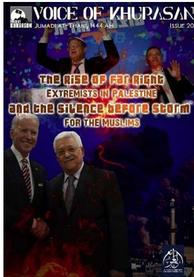
Cover page of the Voice of Khurasan magazine (Telegram, January 15, 2023)

► Other major articles in the magazine criticize the relationship being forged between the Taliban regime in Afghanistan and the Chinese regime and the attitude of the regime in India towards the Muslims in the country (Telegram, January 15, 2023).