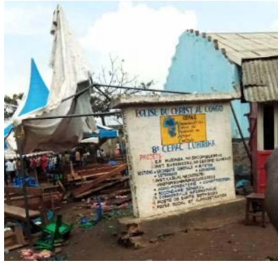
Destruction in the church courtyard after the detonation of the IED