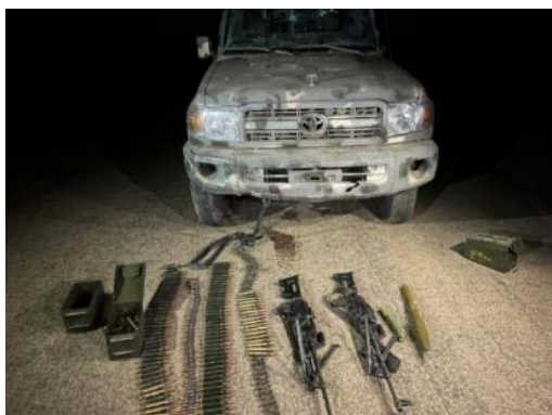
ISIS vehicle, weapons, and ammunition found at the scene of the fighting (The Cable, January 14, 2023)

► According to military sources in Nigeria, on the evening of January 13, 2023, ISIS operatives attacked a Nigerian army camp in the village of Azri, about 80 km southwest of Maiduguri, the capital of Borno State, in northeastern Nigeria, using a relatively large force, which included three armored vehicles, four vehicles carrying machine guns, and an unknown number of motorcycles, as well as various ammunition. During the exchange of fire, the camp soldiers received air support from the Nigerian Air Force. Three soldiers were severely wounded and several ISIS operatives were killed (The Cable, January 14, 2023). ISIS claimed responsibility for the attack, stating that a number of soldiers were killed or wounded and that ISIS operatives seized weapons and ammunition, without mentioning whether the organization suffered casualties in the attack (Telegram, January 14, 2023).