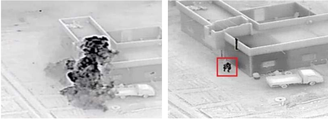
Right: An ISIS operative attempting to escape from the house. Left: The explosion as a result of the detonation of the explosive belt (SDF Press, January 13, 2023)