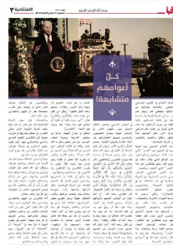
Al-Naba editorial entitled “All their years are similar” (Telegram, January 5, 2023)

►The author concludes by claiming that despite the material and military superiority of the West, it does not succeed in defeating ISIS and has no solutions that will lead to its elimination. He calls on ISIS’s operatives and supporters to continue to adhere to jihad until the end of time and emphasizes that Allah foils the plots of the enemies - the Jews, the Christians, and the infidel Muslims - and makes all their years similar.