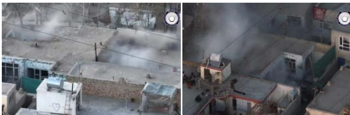
Activity against ISIS in Kabul (Twitter account of the Afghan Intelligence General Directorate, January 5, 2023)

► On January 4, 2023, the Taliban security forces, acting on intelligence, operated against ISIS hideouts in the city of Kabul, killed eight ISIS operatives, and arrested seven others (Bakhtar News Agency, January 6, 2023). Taliban spokesman Dhabih Allah Mujahid announced that the operatives had played a major role in the attack on the hotel where Chinese citizens were staying in Kabul on December 12, 2022 1 (Al-Arabiya, January 5, 2023).