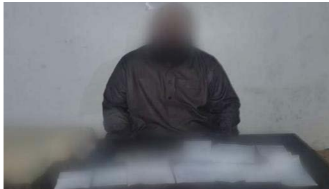
ISIS's former official in charge of finances in the Deir ez-Zor Province, who was detained (SDF Press, January 4, 2023)

► Special units of the SDF forces operating on January 4, 2023, with Global Coalition air support arrested a former ISIS commander in Mazraat Hittin, about 3 km northwest of Al-Raqqah. The detainee, suspected of being connected to active and dormant ISIS terrorist cells, was previously ISIS's official in charge of finances (Emir Bayt al-Mal) in Deir ez-Zor and fled in 2019 when SDF forces and the Global Coalition operated in the area. Documents in his possession were seized (SDF Press, January 4, 2023).