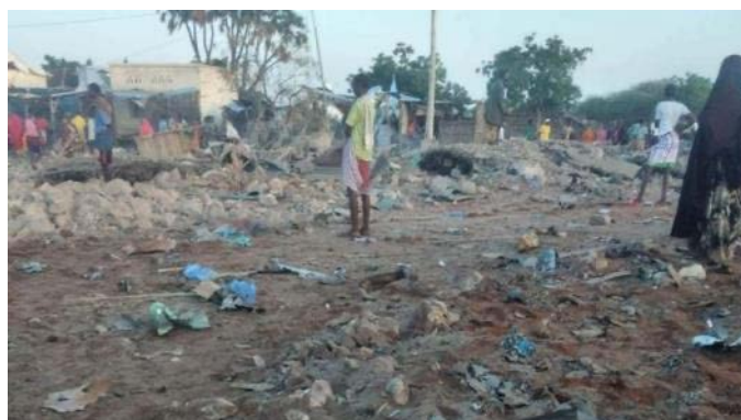
The scene of the explosion of one of the two car bombs in the town of Mahas (Somali Guardian, January 4, 2023)