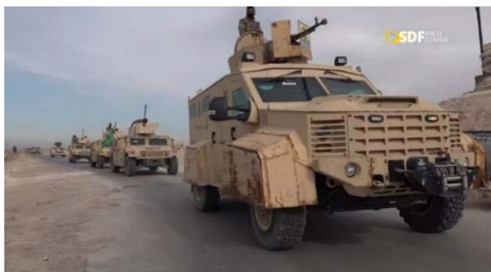
Convoy of SDF armored vehicles during Operation Al-Jazeera Thunderbolt (SDF Press, January 4, 2023)

► The US-led Global Coalition against ISIS and the Kurdish SDF forces completed Operation Al-Jazeera Thunderbolt (Saiqat Al-Jazeera) against the presence of ISIS in the Al-Hawl camp area, and the Tel Hamis area east of Al-Hasakah. During the operation, which lasted nine days (December 29, 2022 - January 6, 2023), 102 wanted ISIS operatives who had a part in planning and carrying out terrorist attacks were arrested. Also, 27 people were arrested who provided ISIS operatives with logistical support or distributed ISIS propaganda. An additional 25 people were arrested for criminal activity (SDF Press, January 8, 2023).