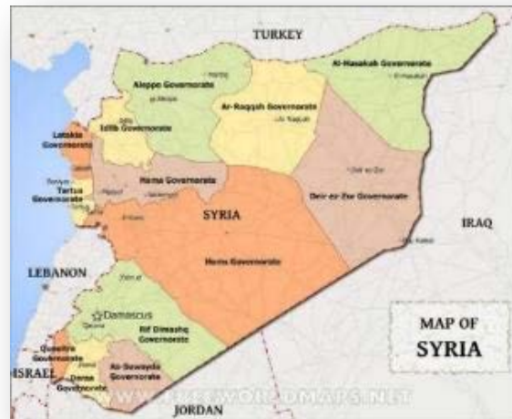
Map of Syria's provinces (freeworldmaps.net)