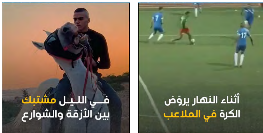
Pictures from the video: a soccer player by day and a terrorist by night (Shehab, December 22, 2022).