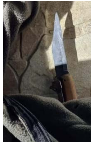
Right: The knife used in the attack. Left: The mourning notice issued by Hamas.