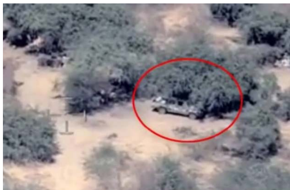
An ISIS ATV before it was destroyed in the airstrike (@Zagazola Twitter account, November 29, 2022)