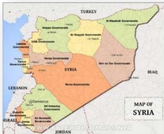
Map of Syria's provinces