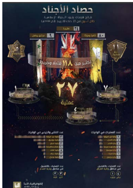
Summary of ISIS’s attacks (Al-Naba, Telegram, November 24, 2022)

number of attacks was carried out by ISIS’s West Africa Province (7). Attacks carried out in the other provinces: Iraq (5); Syria (5); Central Africa (4); Mozambique (4); Sinai (1); and Khorasan, i.e., Afghanistan (1). A total of 118 people were killed and wounded in the attacks, compared to 42 in the previous week. The largest number of casualties was in the West Africa Province (72). The other casualties were in the following provinces: Mozambique (15); Iraq (11); Central Africa (10); Syria (5); Sinai (3); and Khorasan, i.e., Afghanistan (2) (Al-Naba weekly, Telegram, November 24, 2022). This indicates a continuation of ISIS’s activity at a relatively low scale around the world.