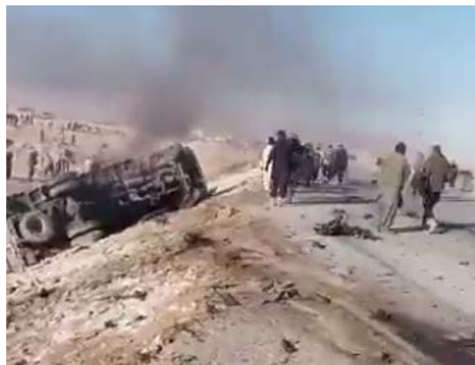
The truck that was hit by the explosion of the rickshaw (@Mughees Ali Twitter account, November 30, 2022)

► On November 30, 2022, a rickshaw carrying an explosive device collided with a truck carrying Afghan police officers and civilians in the Balali region, in western Pakistan, near the border with Afghanistan. As a result of the explosion of the device, whose weight was estimated at 25 kg, at least three people were killed, including a woman, and about 28 people were injured, including 20 police officers. The truck overturned and two other vehicles were damaged (Dunya News, November 30, 2022).