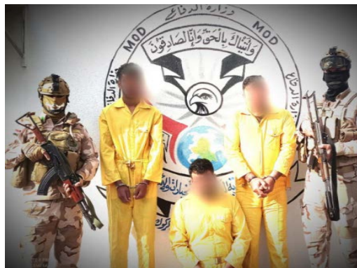
The three ISIS operatives who were detained (SecMedCell Facebook page, November 27, 2022)

► On November 27, 2022, the Iraqi security forces operated against ISIS squads in the Kirkuk Province. Three ISIS squad members were detained. They had planned to carry out terrorist activity against the Iraqi security forces in the province (SecMedCell Facebook page, November 27, 2022).