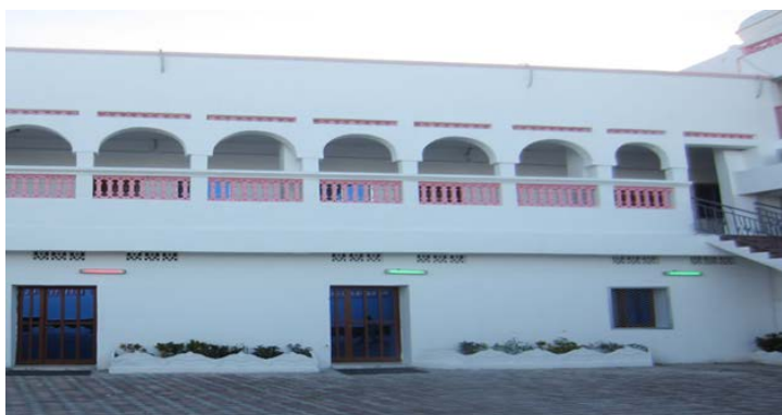
Villa Rose Hotel in Mogadishu (the Villa Rose Hotel website)

► On November 28, 2022, operatives of the Al-Qaeda-affiliated Al-Shabaab Organization attacked the Villa Rose Hotel in Mogadishu. The hotel is the site of a restaurant popular among members of the Somali government and security establishment. The attack began with an explosion, apparently of a car bomb, followed by two more explosions and then a shooting attack. Special Forces of the Somali government exchanged fire for over 12 hours with the attackers, who had barricaded themselves in the hotel. Dozens of Somali administration personnel and civilians who were on the scene during the attack were rescued. A spokesman for the Somali police reported that eight civilians and a soldier had been killed. Five other soldiers were wounded. Somali sources reported that Somalia's Minister of Defense, Dr. Muhammad Ahmed Sheikh Ali, had been wounded in the attack. Six Al-Shabaab operatives were killed. The Al-Shabaab Organization claimed responsibility (Akhbar Al-Aan, Okaz, The Washington Post, November 27, 2022; The Guardian, November 28, 2022).