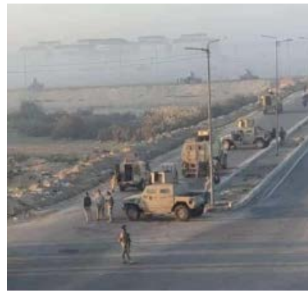
Right: An Egyptian army force that operated in the area (ManalMo82907893 Twitter account, November 19, 2022). Left: Smoke clouds rising from the scene of the exchanges of fire (radwa_rody88 Twitter account, November 19, 2022)