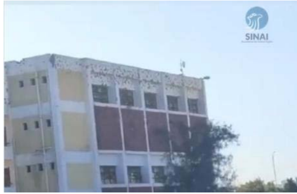
Right: The school where the ISIS operatives barricaded themselves. Left: Damage caused by a missile fired at the building from an Egyptian fighter jet