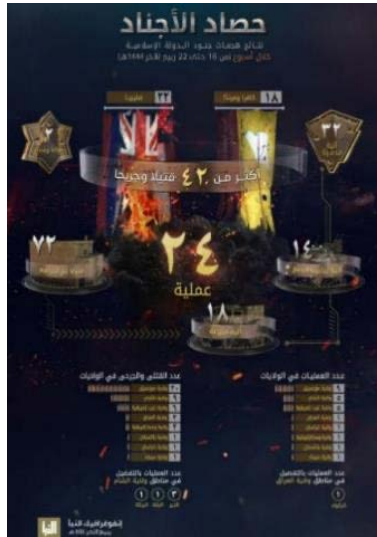
Summary of ISIS attacks (Al-Naba, Telegram, November 17, 2022)