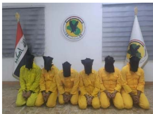
The six detained ISIS operatives (SecMedCell Facebook page, November 21, 2022)

► On November 21, 2022, Iraqi counterterrorism unit fighters operating in the Erbil Province in intelligence coordination with the General Directorate of the Asayish (the Kurdistan Province internal security forces) detained six ISIS operatives (SecMedCell Facebook page, November 21, 2022).