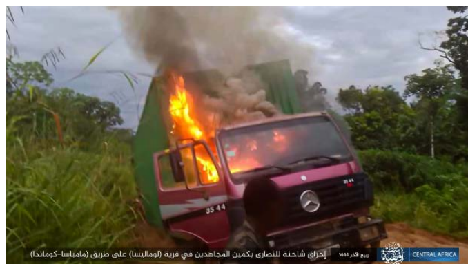
Truck set on fire by ISIS operatives in the village of Lumalisa (Telegram, November 21, 2022)