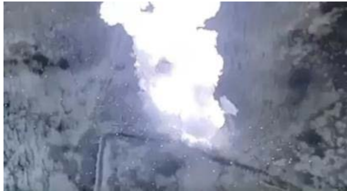
Smoke rising from one of ISIS's hiding places in Wadi Zaghaytun (SecMedCell Facebook page, November 21, 2022)

bodies of six ISIS operatives at the site (Al-Sumaria, November 21, 2022). Four ISIS hiding places were destroyed in attacks carried out in Wadi Zaghaytun, about 35 km southwest of Kirkuk (SecMedCell Facebook page, November 21, 2022).