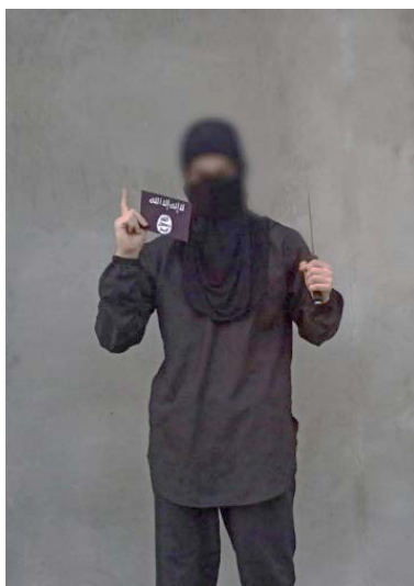
The stabber holding a knife and an ISIS flag (Telegram, November 21, 2022)

► Chechnya leader Ramzan Kadyrov said that a terrorist armed with a knife stabbed to death a policeman in the center of the capital Grozny while he was on his way to purify himself for prayer. The stabber was shot dead while trying to flee the scene after taking the policeman's gun. The identity of the terrorist is unknown but a video was published in the Russian media, in which he is seen being shot by Chechen security personnel (Meduza, November 21, 2022). In a photo published on social media, the terrorist is seen masked, in black clothing, holding a knife in his left hand and an ISIS flag in his right hand (Telegram, November 21, 2022).