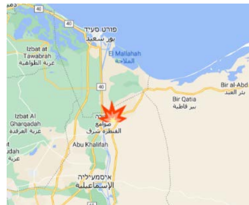
Right: Al-Qantara al-Sharq in the northwestern Sinai Peninsula (Google Maps). Left: The school where ISIS operatives barricaded themselves (Mu'asat Sinaa li-Huquq al-Insan's Twitter account, November 19, 2022)