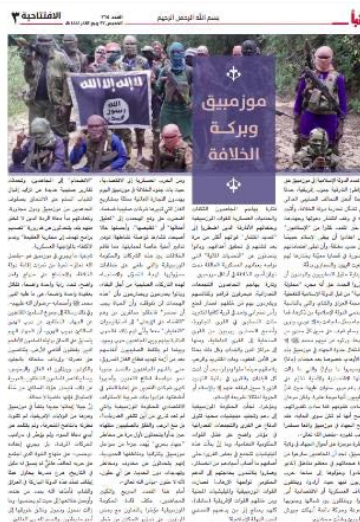
The article entitled “Mozambique and the Blessing of the Caliphate [of ISIS]” (Al-Naba weekly, Telegram, November 17, 2022)

◆ In Mozambique and African countries in general, a new generation of believers is growing, which is not subject to the influence of religious scholars deviating from the path of jihad. The new generation operates in accordance with the path of Muhammad, the prophet of Islam, and is united in the fight against the Global Coalition that works against ISIS and tries in vain to stop its expansion.