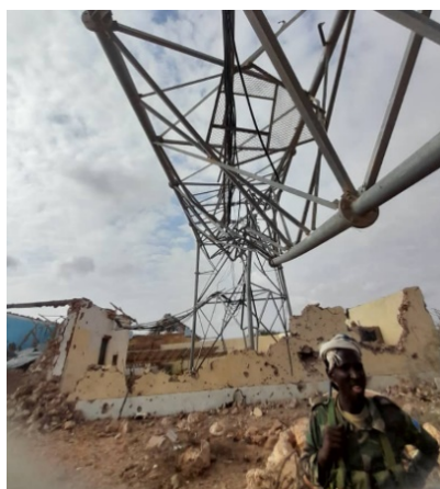
Telecommunications center and tower destroyed northeast of Mogadishu (Hormuud Telecom, November 7, 2022)