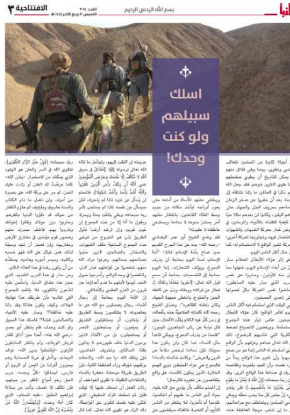
The article “Follow their path even though you are alone” (Al-Naba weekly, Telegram, November 10, 2022)

organization as the Islamic nation needs them now. He adds that they will find the path difficult, but faith in Allah is the fuel that will make them endure and Allah will help those who adhere to him (Al-Naba' weekly, Telegram, November 10, 2022).