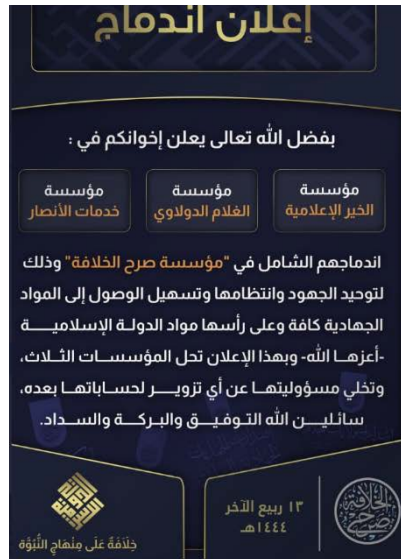
The announcement on the merger of ISIS's propaganda foundations (Telegram, November 8, 2022)