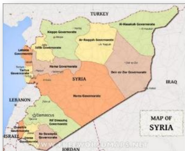
Map of Syria's provinces