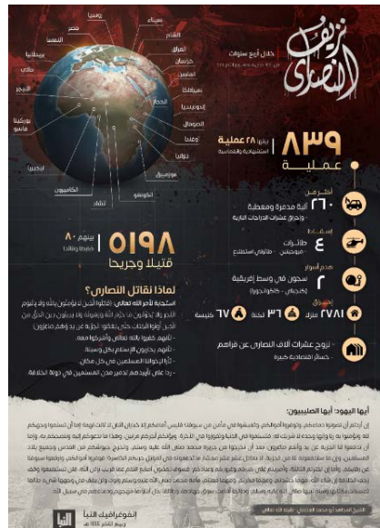
The infographic on ISIS’s activity against Christians in the world in the recent four years