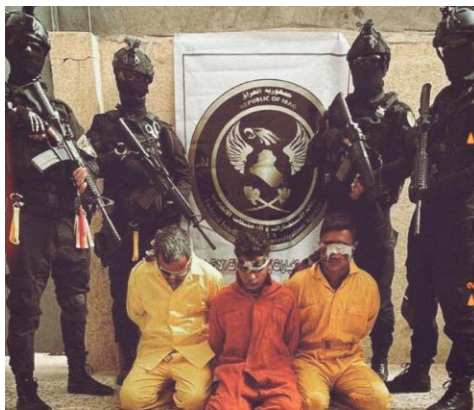
Three ISIS operatives detained in Tarmiyah