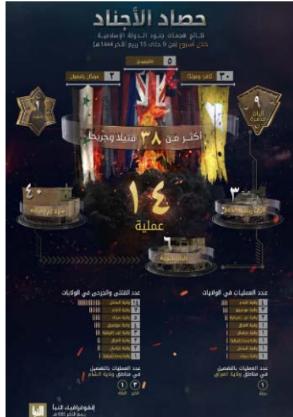
Summary of ISIS attacks (Al-Naba, Telegram, November 10, 2022)

Mozambique (4); West Africa (3); Iraq (2); Khorasan, i.e., Afghanistan (2); and Central Africa (1) (Al-Naba weekly, Telegram, November 10, 2022). This is a continuation of ISIS’s low-scale activity around the world.