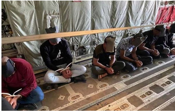
The six detained ISIS operatives (SecMedCell Facebook page, October 19, 2022)

► On October 19, 2022, an Iraqi army force arrested six noteworthy ISIS operatives who had been wanted by the Iraqi security forces (SecMedCell Facebook page, October 19, 2022).