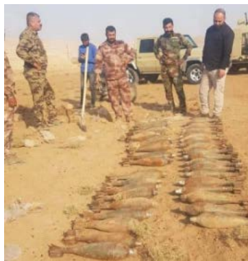
Mortar shells found north of Mosul (Twitter account of the Popular Mobilization Directorate, October 25, 2022)

► A Popular Mobilization force located an ISIS weapons cache, which contained about 40 mortar shells, in the Al-Samaqiya region, north of Mosul (Twitter account of the Popular Mobilization Directorate, October 25, 2022).