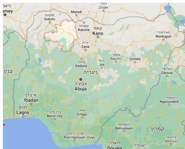
Zamfara State in northwestern Nigeria (Google Maps)