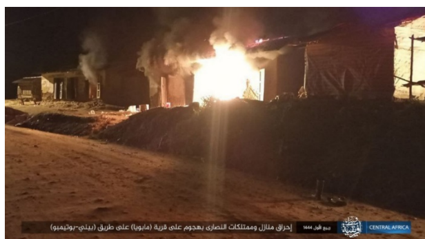
Homes of Christian residents going up in flames in the village of Maboya (Telegram, October 24, 2022)

► On October 19, 2022, a Congolese army compound was attacked in the Christian village of Maboya, about 55 km west of the Congo-Uganda border. The soldiers fled and ammunition was seized. Seven Christian residents were reportedly murdered and several buildings and homes of Christian residents were set on fire (Telegram, October 20, 2022).