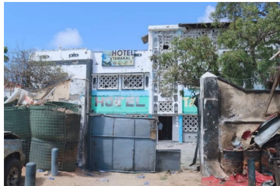
Tawakal Hotel, the target of the attack by Al-Shabaab Organization (Somalia Eye@Somalia_eye Twitter account, October 24, 2022)