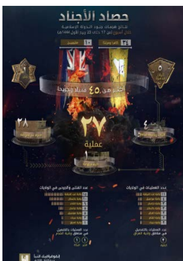
Summary of ISIS attacks (Al-Naba, Telegram, October 20, 2022)

attacks was carried out by ISIS's West Africa Province (11). Attacks carried out in the other provinces: Mozambique (4); Khorasan, i.e., Afghanistan (3); Pakistan (3); Iraq (2); Syria (2); and Sinai (2). A total of 45 people were killed or wounded in the attacks, compared to 54 in the previous week. The largest number of casualties was in the West Africa Province (15). The other casualties were in the following provinces: Pakistan (10); Syria (6); Khorasan, i.e., Afghanistan (5); Mozambique (5); Sinai (3); and Iraq (1) (Al-Naba weekly, Telegram, October 20, 2022). The infographic reflects a continuation of ISIS's relatively limited scope of activity. Africa continues to lead in the number of attacks.