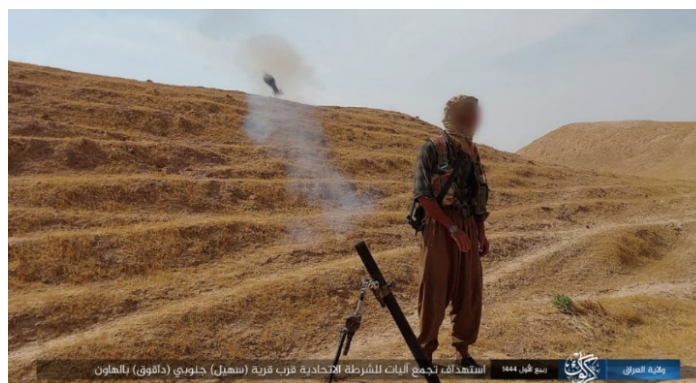
Mortar shells being fired by ISIS at Iraqi police vehicles (Telegram, October 22, 2022)