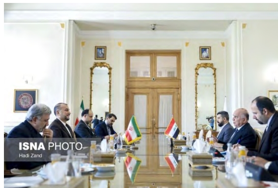
The meeting between the Iranian and Iraqi foreign ministers. (ISNA, August 29)

and Minister of Foreign Affairs Hossein Amir Abdollahian. During the meeting, the foreign ministers discussed bilateral relations, the latest political developments in Iraq, and the ongoing Iraqi mediation effort between Iran and Saudi Arabia. Abdollahian stressed the need to implement the agreements signed by Tehran and Baghdad that would allow to expand trade and economic ties between the two countries. He declared that Iran sees great importance in maintaining the stability and national unity of Iraq and believes that internal disagreements in the country ought to be resolved through legal means, while preserving the authority of the Iraqi government (Tasnim, August 29).