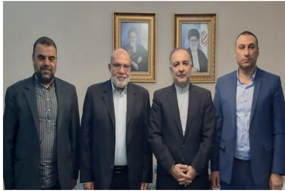
The meeting between the Iranian ambassador to Syria with representatives of PIJ.