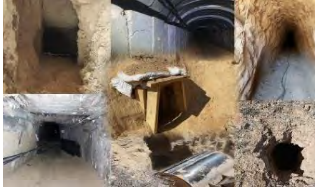
The tunnels that were found (@Oded121351 Twitter account, August 25, 2022)

► The Egyptian security forces in Sinai found seven tunnels, apparently on the Rafah-Gaza border (@Oded121351 Twitter account, August 25, 2022).