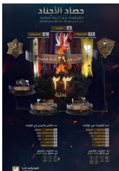
Summary of ISIS attacks (Al-Naba weekly, Telegram, August 25, 2022)

number of attacks was carried out by ISIS’s Iraq Province (11). Attacks carried out in the other provinces: West Africa (6); Syria (3); Central Africa (1); Khorasan, i.e. Afghanistan (1); and Sinai (1). A total of 29 people were killed or wounded in the attacks, compared to 50 in the previous week. The largest number of casualties was in the Iraq Province (10). The other casualties were in the following provinces: Central Africa (7); Syria (6); Khorasan, i.e. Afghanistan (4); Sinai (1); and West Africa (1) (Al-Naba weekly, Telegram, August 25, 2022).