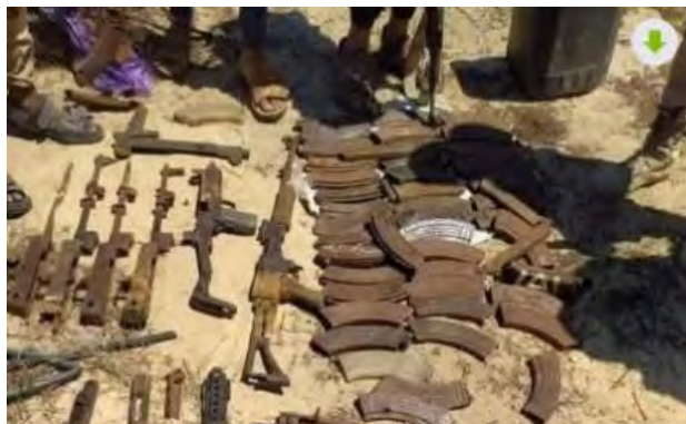
ISIS weapons found in the village of Jalbanah and its environs (Sinaa Mubasher Facebook page, August 25, 2022)

► Egyptian security forces carried out searches for ISIS operatives in the village of Jalbanah. During the past two weeks, this was the site of fighting between the Egyptian army and the Sinai Tribal Union on the one hand, and ISIS on the other. A total of 59 ISIS operatives were reportedly killed during the fighting, others were detained, and weapons were found (Sinaa Mubasher Facebook page, August 25, 2022).