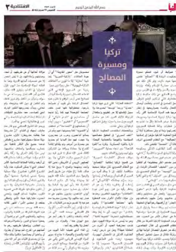
The editorial in ISIS’s Al-Naba weekly (Al-Naba, Telegram, August 25, 2022)