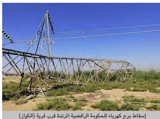
One of the high-voltage pylons blown up by ISIS (Al-Naba, Telegram, August 25, 2022)