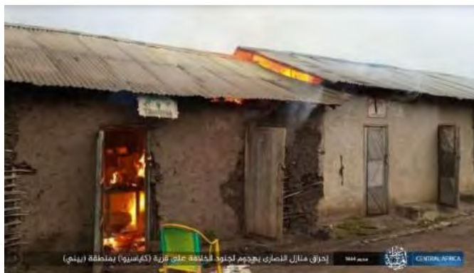
Christian homes set on fire by ISIS operatives in the village of Kabasiwa