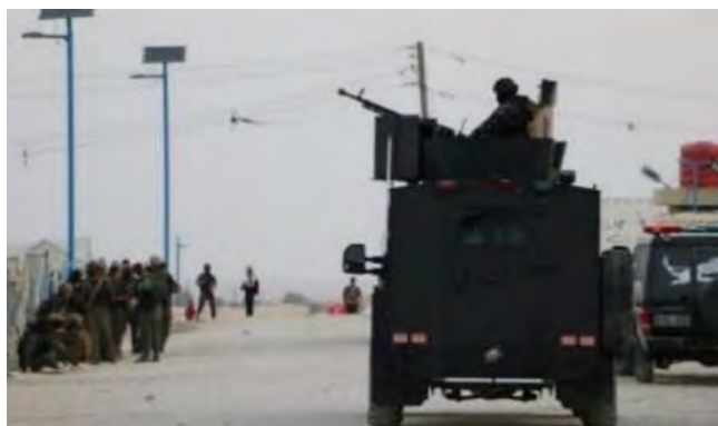
The SDF forces inside the Al-Hawl camp

► The SDF forces, operating against ISIS squads in the Al-Hawl camp, about 35 km east of Al-Hasakah, detained about 60 men suspected of being members of ISIS sleeper cells. In response, ISIS released a leaflet calling on its supporters to help the organization's operatives in the camp and encouraging them to provide financial support for the wives of ISIS's operatives (Al-Arab, August 28, 2022; Syrian Observatory for Human Rights, August 29, 2022). Family members of ISIS operatives are held in the Al-Hawl camp. According to the SDF forces, the camp has become a "constant danger" and ISIS is operating there to recruit operatives for its ranks and disseminate its ideology (Enab Baladi, August 25, 2022; Rudaw, August 28, 2022).