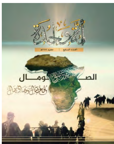
The cover of the Uma Wahida magazine (Telegram, August 30, 2022)

► The latest issue of Al-Qaeda's magazine Uma Wahida was devoted to Somalia. The magazine predicts that the Al-Shabaab movement will soon take over Somalia, just as the Taliban took over Afghanistan in August 2021. According to the magazine, the signs that indicate this are the increase in the number of attacks in the capital Mogadishu; the weakness of the country's central regime; Al-Shabaab's control over a large population that is loyal to it; and international circumstances that will enable this to happen (Telegram, August 30, 2022).