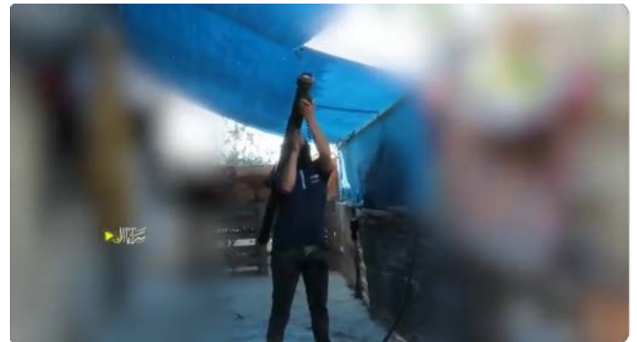
Pictures from a Jerusalem Brigades video of an air defense operative following the flight of an Israeli aircraft in the skies over the southern Gaza Strip and firing an RPG at it (Jerusalem Brigades website, August 8, 2022).