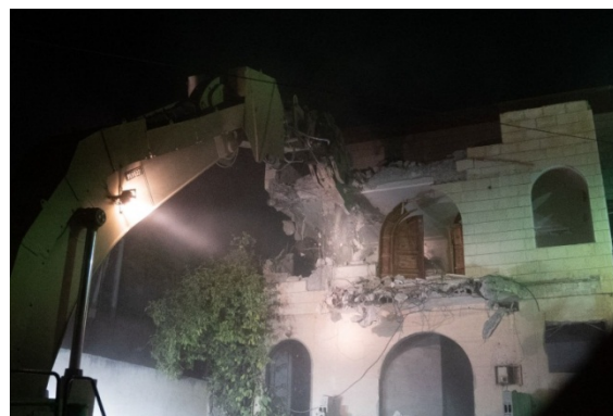
Demolition of the houses (IDF spokesman's Twitter account, August 8, 2022).