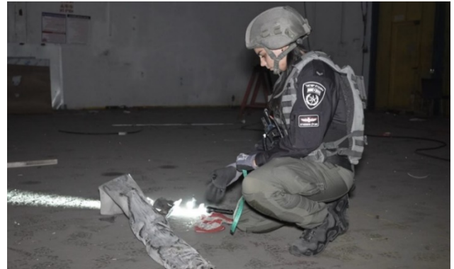
Right: An Israeli police demolitions expert removes the rocket from the factory in Ashqelon. Left: Israeli security forces at the site.