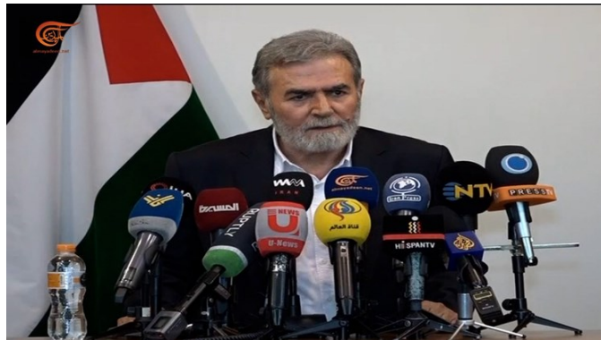
Ziyad al-Nakhlah's press conference in Tehran (al-Mayadeen TV, August 7, 2022).