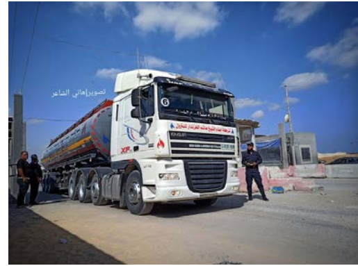
Right: Trucks bringing diesel fuel en route to the Gaza Strip. Left: The trucks arrive at the power plant.