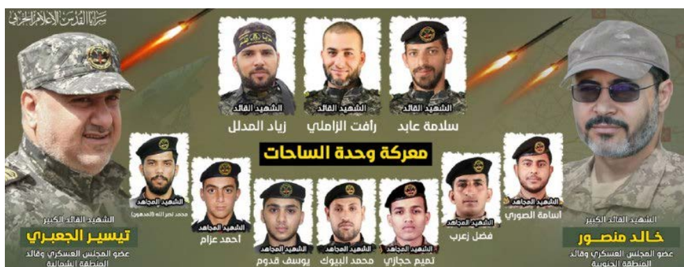
The notice issued by the Jerusalem Brigades with the names of the operatives who were killed (Jerusalem Brigades' Telegram channel, August 8, 2022).