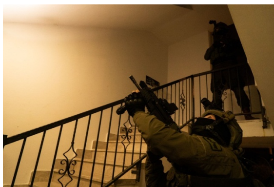
Right: An IDF activity. Left: Confiscated weapon (IDF spokesman's Twitter account, August 8, 2022).

► On the night of August 7 Israeli security forces operating in the village of Rummanah, northwest of Jenin, demolished the houses of the terrorists who carried out the stabbing attack at Elad on May 5, 2022, killing three Israelis and wounding several others (IDF spokesman's Twitter account, August 8, 2022). Hamas condemned the demolitions.