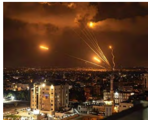
Rockets launched from the Gaza Strip at Israel (Right: Twitter account of Khaled Safi from Gaza, August 5, 2022. Left: Facebook page of the Ghaza al-A'an website, August 5, 2022).

► On the second day of the operation, the PIJ continued launching rockets and mortar shells at the communities near the Gaza Strip, the southern cities of Sderot and Netivot, and the coastal cities of Ashqelon and Ashdod. In the afternoon a barrage of rockets was launched at