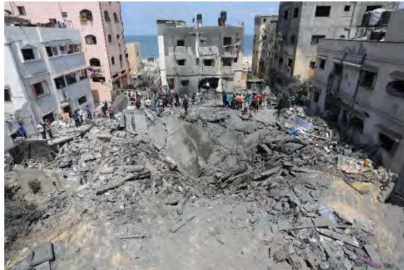
Right: The ruins of a building in the southern part of Gaza City, attacked on August 6, 2022. Left: A Jerusalem Brigades' post in western Khan Yunis attacked.