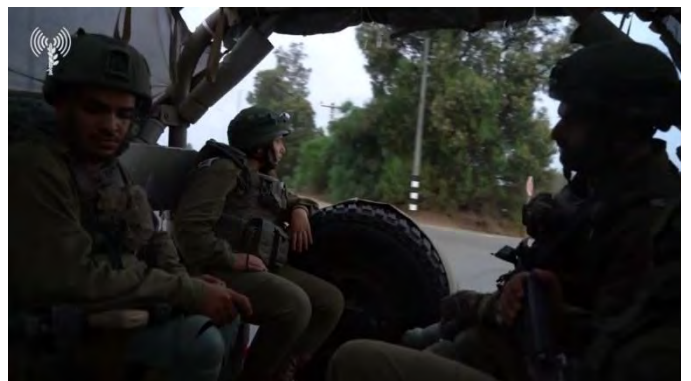
IDF forces deploy in the Gaza Strip sector before the beginning of the operation (IDF spokesman's Twitter account, August 5, 2022).