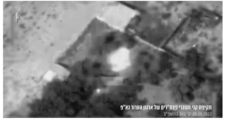
PIJ mortar shell-launchers attacked (IDF spokesman's Twitter account, August 6, 2022).