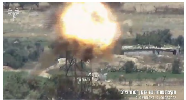
PIJ military-terrorist posts attacked.