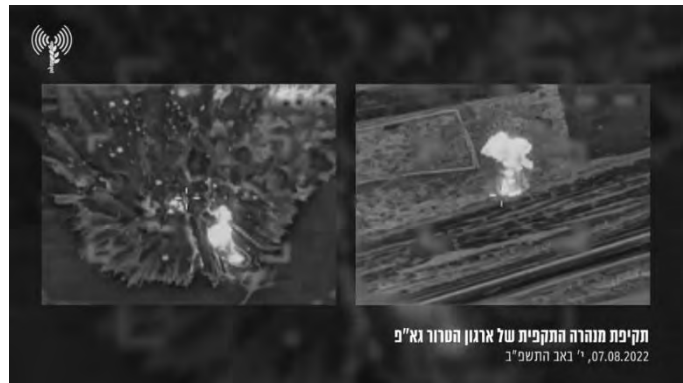
Right: The tunnel is attacked. Left: The tunnel route, lower left.

► The ministry of health in Gaza reported that as of 12 noon, August 7, 2022, 31 Palestinians had been killed and 265 wounded (ministry of health in Gaza Telegram channel, August 7, 2022). The ministry of health also reported that because of the fuel shortage and the shutdown of the power station, within 48 hours they would be forced to stop providing public health services (ministry of health in Gaza Telegram channel, August 7, 2022).