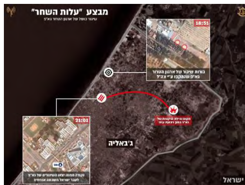
A rocket that misfired and exploded during launch (IDF spokesman's Twitter account, August 7, 2022).

► On the night of August 6, 2022, the Palestinian media in the Gaza Strip began reporting that Israel had attacked near a mosque in the Jabalia refugee camp in the northern Gaza Strip. According to the reports, at least five people had been killed, four of them children. The media immediately began calling the event "the Jabalia slaughter." Israel made it clear that the deaths had been caused by a rocket misfire and not by an Israeli attack (IDF spokesman, August 6, 2022).