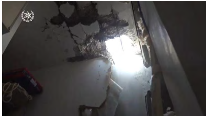
Right: Direct rocket hit on a house in the southern Israeli city of Sderot (Israel Police Force spokesman's unit, August 6, 2022). Left: The rocket and some of the resulting damage (Sderot municipality, August 6, 2022).