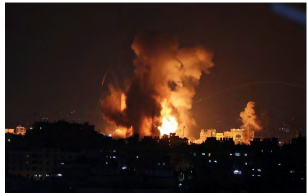
Gaza City attacked (Twitter account of photojournalist Ashraf Abu Amra, August 5, 2022).