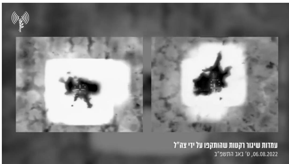
◆ Rocket launchers in the northern Gaza Strip attacked Tunnel for the use of PIJ offense forces. The tunnel route did not cross the border into Israeli territory (IDF spokesman's Twitter account, August 7, 2022).