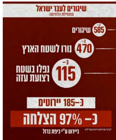
Report from the IDF spokesman, August 7, 2022.

Israel. The Iron Dome aerial defense system carried out about 185 interceptions with a success rate of 97%.