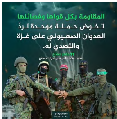
Hamas notice ( Hamas Telegram channel, August 6, 2022).

► Hamas announced that Isma'il Haniyeh was in contact with Egypt, Qatar and the UN, calling for the "invasion" [of the Gaza Strip] to stop in order to keep it from spinning out of control ( Hamas website, August 7, 2022). "Sources" told al-Arabiya that Hamas had updated senior Egyptian officials that the movement had no interest in "escalation" and was waiting for "understandings" ( al-Arabiya , August 7, 2022).