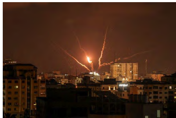
Rockets launched from the Gaza Strip at Israel (Twitter account of photojournalist Hassan Aslih, August 5, 2022).