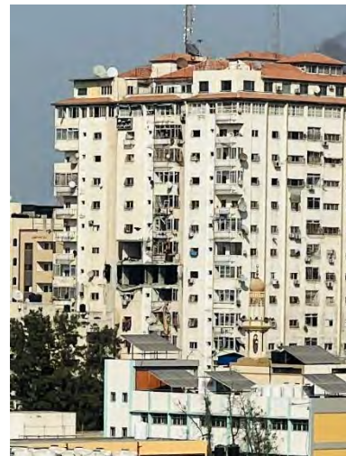
The aftermath of the attack on the apartment in the Palestine Tower where Tayseer al-Jaabari was located.