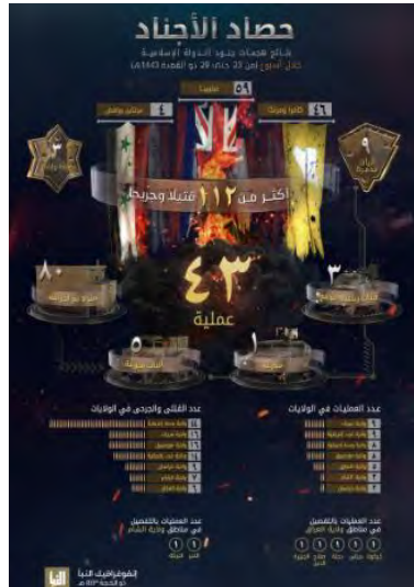
Summary of ISIS attacks (Al-Naba weekly, Telegram, June 30, 2022)