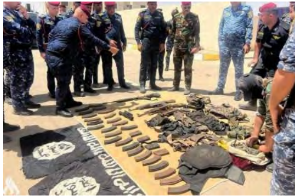
Weapons found (Iraqi News Agency, July 2, 2022)