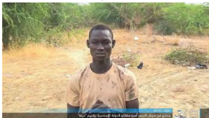
The abducted soldier as photographed by ISIS operatives (Telegram, July 4, 2022)

► On July 3, 2022, ISIS operatives attacked a Nigerien army post in the town of Garin Dogo, in the Diffa region of southeastern Niger, about 3 km north of the Niger-Nigeria border. Twenty soldiers were killed or wounded. One soldier was abducted. According to ISIS, the Nigerien army used helicopters in an attempt to locate the abducted soldier and track down ISIS operatives who withdrew from the area (Telegram, July 4, 2022).