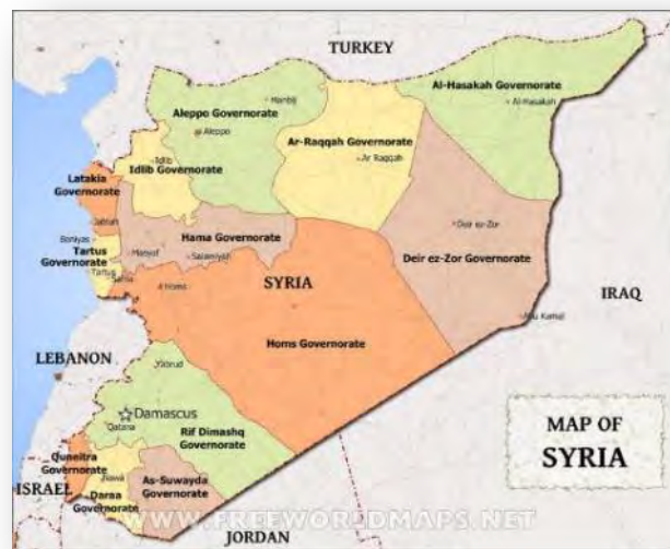
Map of the Syrian provinces (freeworldmaps.net)