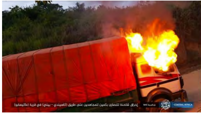
A Christian resident's truck being set on fire by ISIS (Telegram, July 2, 2022)