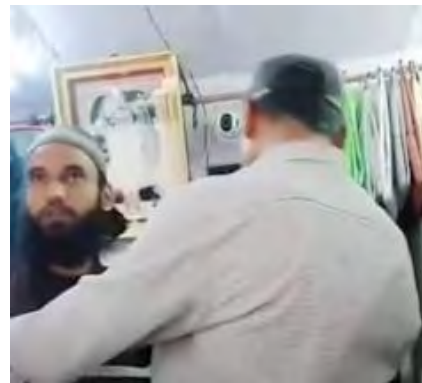
Right: One of the killers impersonates a customer of the tailor. Left: The two murderers brandishing the knives used to commit the murder (from a video of the murderers, Telegram, June 29, 2022)