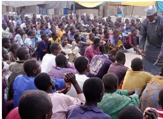
The operatives who surrendered to the Nigerian security forces (Facebook page of the Nigerian army, June 29, 2022)

► On June 29, 2022, a total of 314 operatives of both Boko Haram and ISIS's West Africa Province surrendered to the Nigerian security forces in the Bama region of Borno State, in northeastern Nigeria (Facebook page of the Nigerian army, June 29, 2022).