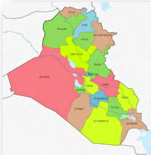
Provinces of Iraq (Wikipedia)