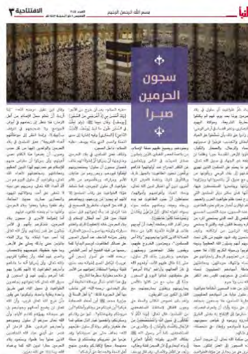
The editorial as it appeared in ISIS’s Al-Naba weekly (Al-Naba weekly, Telegram, June 30, 2022)

► The editorial of this week’s issue of ISIS’s Al-Naba weekly was entitled, “The prisons of [the land] of the two holy places [Mecca and Medina, i.e.: Saudi Arabia] – be patient.” The article attacks the Saudi leadership and calls on ISIS’s supporters and operatives to work for the release of the ISIS operatives incarcerated in Saudi prisons. The author notes that the “tyrannical” Saudi regime is fighting against Islamic law (sharia), promoting alliances with Jews and Christians, spreading corruption and torturing incarcerated Muslim believers. According to the author, the believers have a duty to work for the release of incarcerated ISIS operatives. Finally, the author encourages the prisoners, noting that their struggle is not in vain and that Allah will overthrow the Saudi royal family through the believers and will restore the land of the two holy places to the bosom of Islam (Al-Naba weekly, Telegram, June 30, 2022).