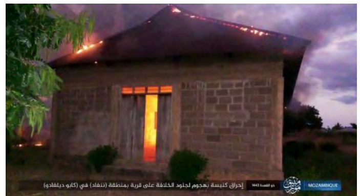
Churches set on fire by ISIS (Telegram, June 20, 2022)