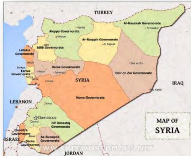
Map of the Syrian provinces (freeworldmaps.net)