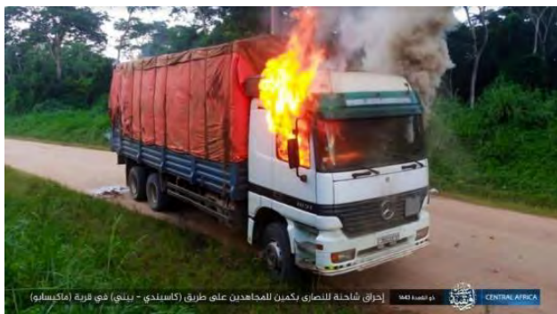
Truck set on fire in the village of Makisabo (Telegram, June 22, 2022)

► On June 21, 2022 , ISIS fired at a convoy of Christian residents on the Kasindi-Beni road. Five Christians were killed and four vehicles were set on fire (Telegram, June 22, 2022).