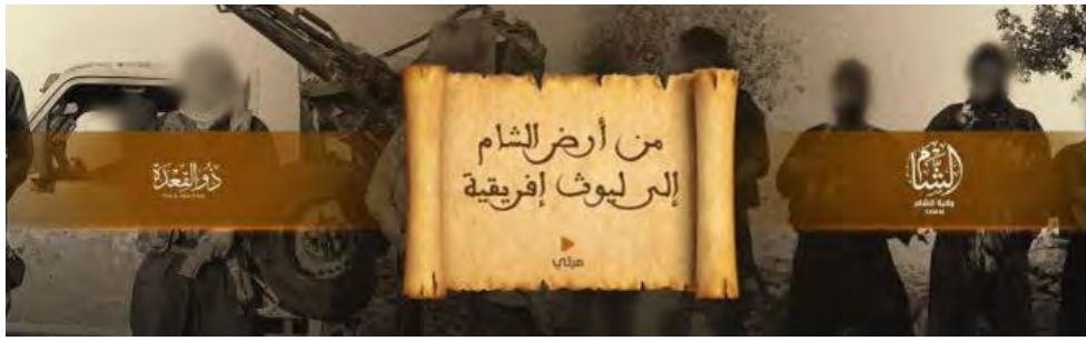
The video “From the Soil of Syria to the Lions of Africa” (Telegram, June 24, 2022)