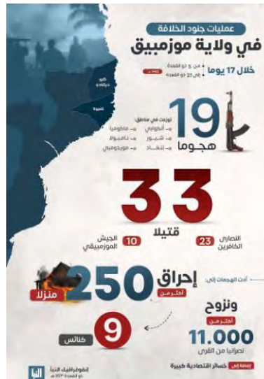
Summary of the activity of the Mozambique Province (Al-Naba weekly, Telegram, June 23, 2022)