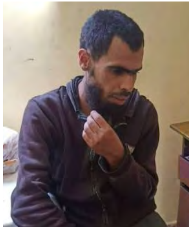
ISIS operative who turned himself in to the Egyptian security forces (Akhbar Sinaa al-Aan Facebook page, June 24-26, 2022)

► Due to the Egyptian security forces' activity in the region, three ISIS operatives, apparently Palestinians, fled the Rafah region to the Gaza Strip (Akhbar Sinaa al-Aan Facebook page, June 25, 2022).