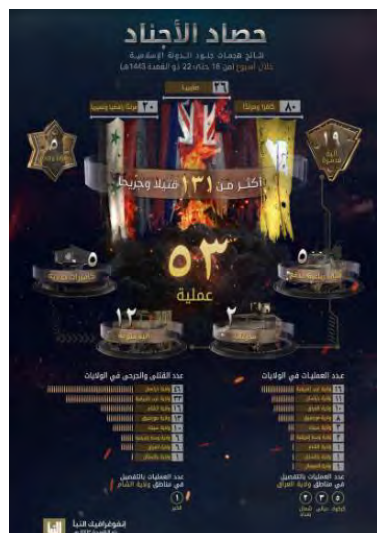
Summary of ISIS attacks (Al-Naba weekly, Telegram, June 23, 2022)

► The infographic indicates that the number of ISIS attacks remained similar to the previous week, despite the dramatic decrease in the number of casualties. There was an increase in the number of attacks in the Khorasan Province (11 compared to 6 last week). The most noteworthy attack was carried out in a Sikh temple in Kabul.