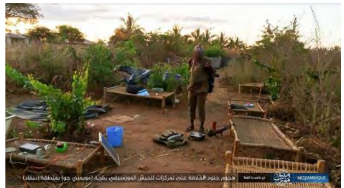
ISIS operatives in a compound that had been used by the Mozambican army in the village of Muimbi Jo, in the Nangade region, in the Cabo Delgado Province, on June 20, 2022 (Telegram, June 21, 2022)

► On June 19, 2022 , ISIS attacked the Christian village of Makaya, in the Ancuabe District, in the Cabo Delgado Province. ISIS operatives beheaded two Christians and set two churches on fire (Telegram, June 20, 2022).