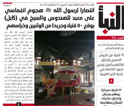
Right: The text of the editorial in Al-Naba weekly (Al-Naba weekly, Telegram, June 23, 2022)

►Following the attack on the Sikh temple in Afghanistan, which ISIS described as an act of revenge against the Hindu and Sikh “infidels,” carried out in light of statements made by members of India’s ruling party against the Prophet of Islam, ISIS felt that it had an advantage over other Islamic elements, since those elements made do with threats. Therefore, it is attempting to present itself as a “defender of Islam” and its Prophet, in order to leverage this to strengthen its status, garner support and recruit operatives. This idea also appeared in the Al-Naba weekly’s lead article, which was devoted to the Sikh temple attack, presenting it as an act of protecting the good name of the Prophet and the Sikh temple as a “Sikh and Hindu temple,” in order to include India’s Hindu majority in the equation 2 .