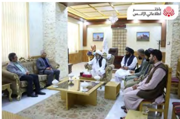
The meeting of the Iranian consul general in Herat with the governor of the province.