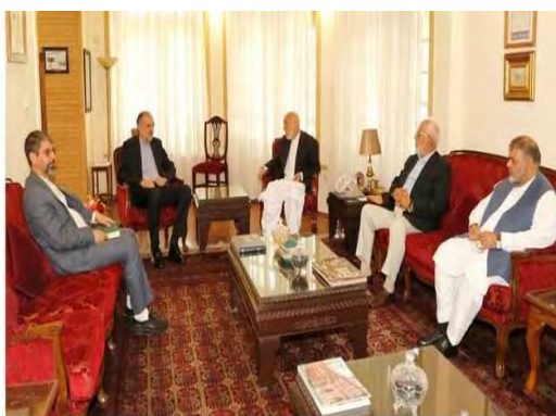
The meeting between the Iranian ambassador to Kabul with the former Afghan President, Hamid Karzai.

► On June 20, the Iranian Ambassador to Kabul, Bahador Aminian, met with the Deputy Foreign Minister of the Taliban government, Sher Mohammad Abbas Stanekzai, and discussed the matter of Afghan refugees in Iran, cross-border drug smuggling, and cooperation between the two countries. Additionally, in recent days, the ambassador held meeting with the former President of Afghanistan, Hamid Karzai, and with the former Chairman of the Afghan National Reconciliation Committee, Abdullah Abdullah, and discussed with them the latest developments in Afghanistan and the region (ISNA, June 20).