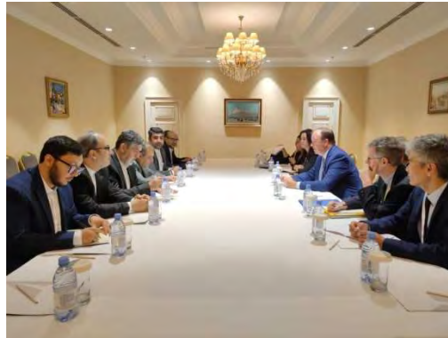
The meeting of the Iranian delegation to the Astana Talks with representatives of the United Nations.