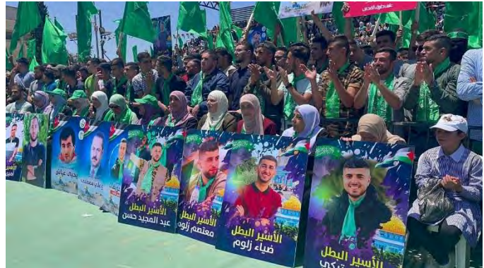
Victory celebrations of the Islamic Bloc at Birzeit University (QUDSN Twitter account, May 19, 2022)