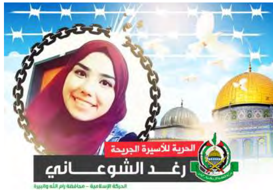
Right: Poster distributed by Hamas, calling for the release of Al-Shuani (Hamas - Nablus district's Facebook page, July 30, 2016). Left: The knife found in the Palestinian's bag (Israel Police Spokesperson's office, July 27, 2016)