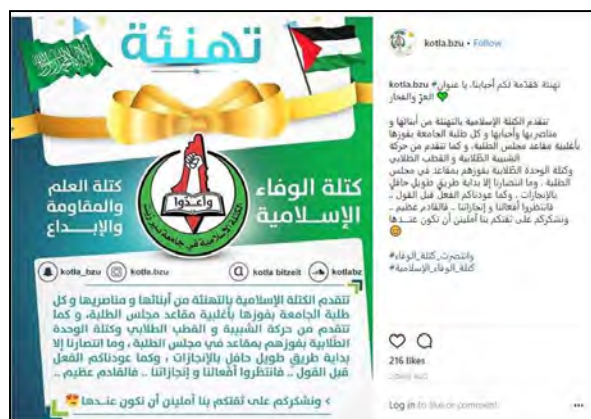
Right: Announcement by the Hamas student faction at Birzeit University thanking voters for its victory in the 2018 elections (Instagram account of the Islamic Bloc at Birzeit University, May 10, 2018). Left: Victory rally held by the Islamic Bloc on the occasion of its victory in April 2016 (Facebook page of Hamas in Ramallah and Al-Bireh, April 28, 2016)