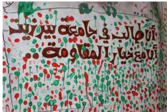
Right: Poster presented in the exhibition, with the text, “I’m a student at Birzeit and I have the option of resistance.” The students signed the poster to express their agreement. Left: Israeli flag spread on the floor at the entrance to the exhibition so that visitors can step on it (Facebook page of the Islamic Bloc at Birzeit University, October 28, 2015).

► On September 17, 2014, the Islamic Bloc at Birzeit University organized a rally to mark Hamas’s victory in Operation Protective Edge. During the rally, Islamic Bloc students marched on campus with their faces masked, wearing shirts of Hamas’s military wing. The demonstrators waved Hamas flags and posters. After the march, the students held a rally in one of the university’s halls, where weapons used in the operation, such as the new sniper’s