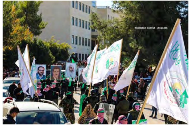
Procession of the Islamic Bloc. Uniformed operatives can be seen as well as flags of the Hamas military wing

► In December 2018, Hamas’s Islamic Bloc held a rally under the slogan “Resistance creates victory.” Before the rally, the Islamic Bloc held a procession around the campus, waved the movement’s flags, and chanted slogans in favor of the “resistance.” Hamas’s senior operative Hassan Yusuf spoke at the rally, saying that Hamas is ready to continue on the path of “resistance” and confront the “occupation” until the Palestinians realize their goals and achieve their freedom (Hamas’s website, December 12, 2018).