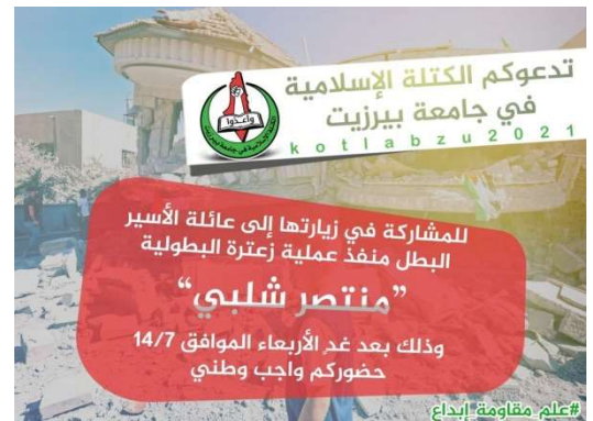
Right: The invitation calling on students to visit the home of Montaser Shalabi’s family (Facebook page of the Islamic Bloc at Birzeit University, July 12, 2021). Left: The student delegation (Facebook page of the Islamic Bloc at Birzeit University, July 15, 2021)