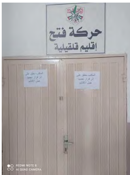
The Fatah office in Qalqilya is closed in protest over the Fatah list's defeat in the elections (Shehab Twitter account, May 23, 2022)