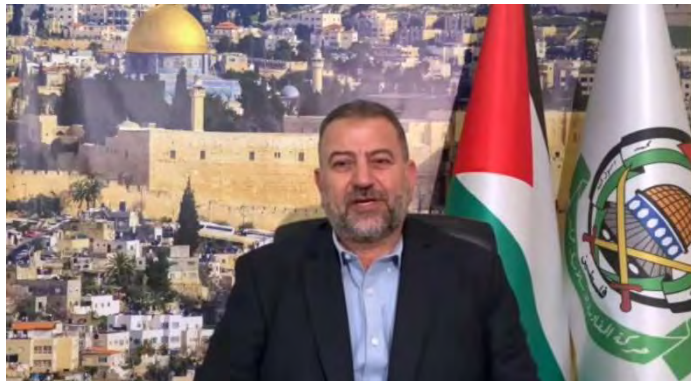
Saleh al-Aroui praising the victory in Birzeit

► According to Saleh al-Aroui, deputy head of Hamas's political bureau and the official in charge of Hamas's activity in Judea and Samaria , the democratically conducted elections in Birzeit proved their ability to hold transparent and fair elections expressing the will of the Palestinian people (QUDSN YouTube channel, May 18, 2022).