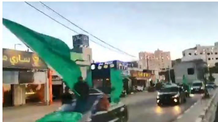
Right: A convoy of cars and joyful celebrations in Dura. Left: Candy being handed out in Tubas