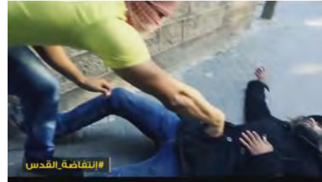
Selected photos from the video