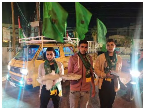
Candy being handed out in Khan Yunis