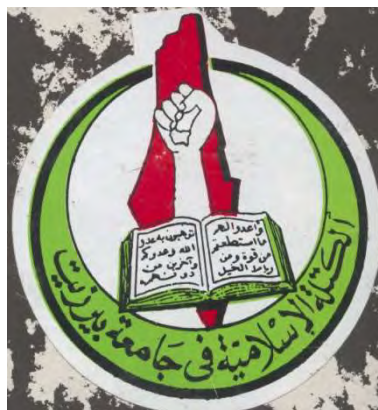
Logo of the Hamas faction at the student union

► Since its establishment, Hamas has attached importance to activity among the student public in Judea and Samaria. This is part of its general perception, in the spirit of the Muslim Brotherhood movement, whereby activity in the area of dawa (religious-cultural indoctrination) constitutes a central element in shaping Hamas's public image and preserving its power. One of the most prominent bodies in this context is the Islamic Bloc ( Al-Kutla al-Islamiya ), Hamas's student cells, which operate at Palestinian institutions of higher education. The Islamic Bloc has been perceived as part of Hamas and as its epicenter since the movement's early days (1987). According to Hamas's documents, Hamas's Islamic activity at universities is one of the sources of power that enabled the movement's official establishment and rapid growth.