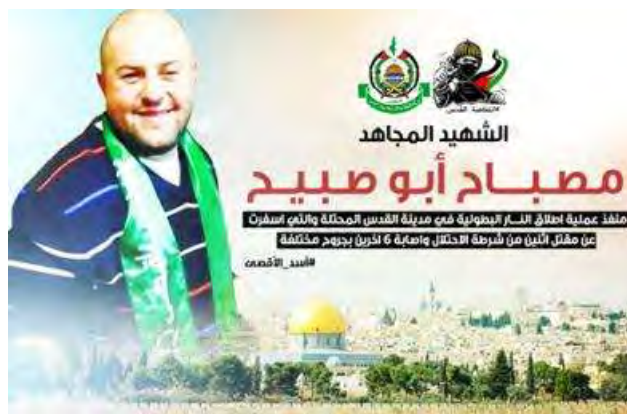
The poster issued in his memory by the Islamic Bloc (Facebook page of the Islamic Bloc at Birzeit University, October 9, 2016)

► On July 11, 2016, the Hamas-affiliated Islamic Bloc at Birzeit University posted the following on its Facebook page: “Bring back the days of blast, blow up the buses ... Bring back the days of blast, humiliate the IDF soldiers.” The post was accompanied by a video posted on the YouTube channel of the Izz al-Din al-Qassam Brigades, entitled “Song of the Blood of the Liberated.” The video shows a masked Palestinian watching videos and photos of terrorist attacks (some real and others staged), clashes on Temple Mount and in Judea and Samaria, and bodies of terrorists from the scenes of the attacks. In the video, the masked Palestinian is shown going to carry out a stabbing attack, after watching those videos and having been inspired by them (Facebook page of the Islamic Bloc at Birzeit University, July 11, 2016; YouTube channel of the Izz al-Din al-Qassam Brigades, June 25, 2016).