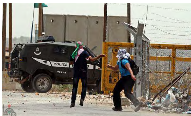
Birzeit University students confronting Israeli security forces in front of Ofer Prison