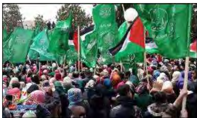
Right: Rally at Birzeit University following the victory in the 2015 elections (Filastin al-Aan, April 23, 2015). Left: Celebrations in Rafah (Filastin al-Aan, April 23, 2015)