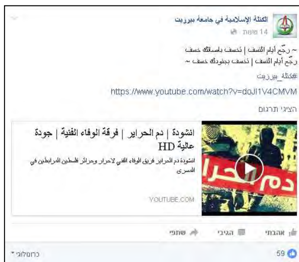
The post that appeared on the Facebook page of the Islamic Bloc at Birzeit, with a link to the video (July 11, 2016)

► On July 11, 2016, the Hamas-affiliated Islamic Bloc at Birzeit University posted the following on its Facebook page: “Bring back the days of blast, blow up the buses ... Bring back the days of blast, humiliate the IDF soldiers.” The post was accompanied by a video posted on the YouTube channel of the Izz al-Din al-Qassam Brigades, entitled “Song of the Blood of the Liberated.” The video shows a masked Palestinian watching videos and photos of terrorist attacks (some real and others staged), clashes on Temple Mount and in Judea and Samaria, and bodies of terrorists from the scenes of the attacks. In the video, the masked Palestinian is shown going to carry out a stabbing attack, after watching those videos and having been inspired by them (Facebook page of the Islamic Bloc at Birzeit University, July 11, 2016; YouTube channel of the Izz al-Din al-Qassam Brigades, June 25, 2016).