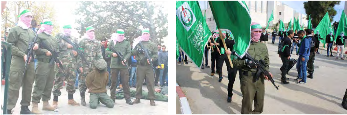
Right: Military parade conducted by activists of the Islamic Bloc. Left: A brief performance put on by the activists, in which they kill an IDF soldier and capture another (Facebook page of the Islamic Bloc at the Birzeit University, December 16, 2015)

► On October 28, 2015, an exhibition dedicated to the wave of terrorism at that time opened at Birzeit University. Organized by Islamic Bloc activists, it presented installations inciting against Israel and calling for the continuation of resistance, as well as installations glorifying the terrorists who carried out the attacks in the current wave of terrorism (Facebook page of the Islamic Bloc at Birzeit University, October 28, 2015).