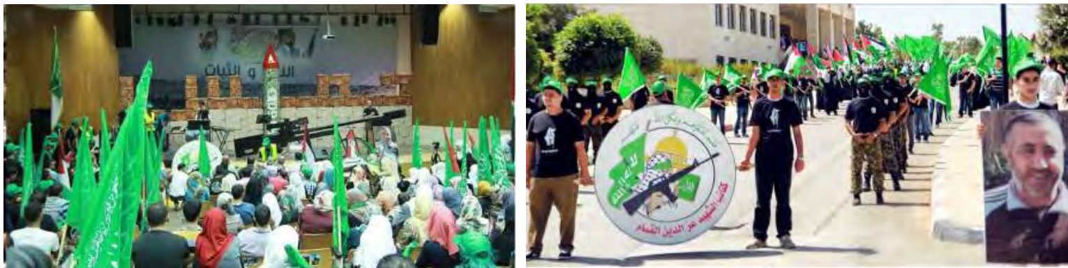
Right: Members of the Islamic Bloc waving Hamas flags and a sign with the logo of the Izz al-Din al-Qassam Brigades. Left: The rally, presenting a model of a sniper's rifle and an R-160 rocket fired by Hamas during Operation Protective Edge (Facebook page of the Islamic Bloc at Birzeit University, September 17, 2014)

rifle and the R-160 rocket, were displayed (Facebook page of the Islamic Bloc at Birzeit University, September 17, 2014).