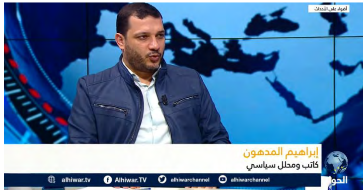
Al-Madhoun interviewed by al-Hiwar TV after Israel and the PA renewed coordination (al-Hiwar TV YouTube channel, November 18, 2020)