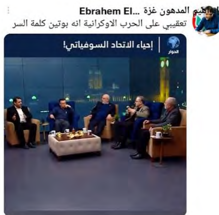
The show on al-Madhoun's Twitter account

► The programs from Istanbul dealt with the following issues: