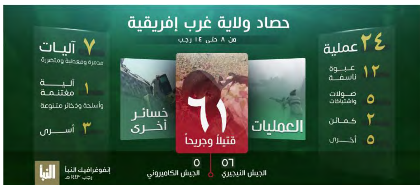
Summary of attacks by ISIS's West Africa Province (Al-Naba' weekly, Telegram, February 17, 2022)

61 military personnel were killed and wounded , 56 Nigerian soldiers and 5 Cameroonian soldiers. Three people were abducted. Seven vehicles were destroyed or put out of commission and one vehicle was seized. ISIS also seized weapons and ammunition (Al-Naba' weekly, Telegram, February 17, 2022).