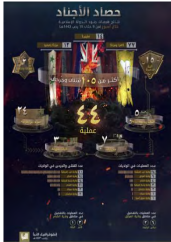
Summary of ISIS's attacks (Al-Naba' weekly, Telegram, February 17, 2022)