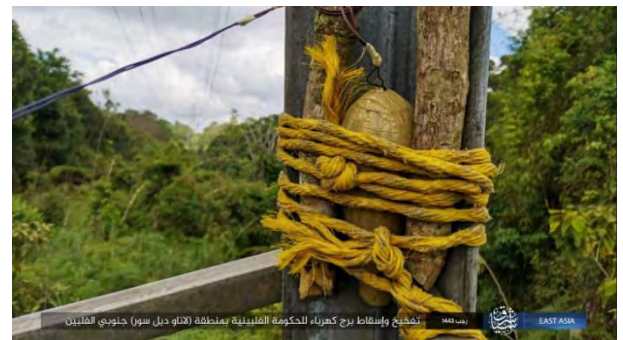
Right: The IEDs attached to the electricity pylon. Left: The report published by ISIS about the destruction of the electricity pylon (Al-Naba' weekly, Telegram, February 17, 2022).