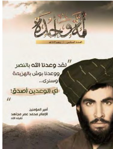
Picture of former Taliban leader Mula Muhammad Omar Mujahed on the cover of Al-Qaeda's Umma wahida magazine (Al-Shahab Media Foundation, February 20, 2022)