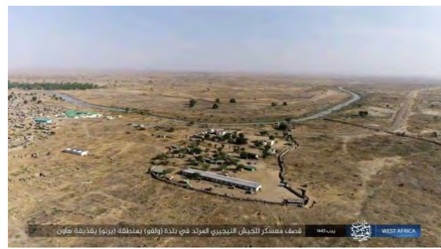
Right: The army base in Wulgo. Left: The mortar shells being fired (Telegram, February 17, 2022)