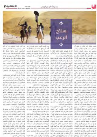
The article advocating the imposition of terror and sowing of fear (Al-Naba' weekly, Telegram, February 17, 2022)

► The lead article in this week's issue of Al-Naba' weekly was entitled "Weapons [sowing] Fear" and is devoted to stressing the importance of the principle of sowing fear among the enemies of Islam. The author also notes that the source of this principle is in the Quran and that according to Islamic tradition ( hadith ), this is also how the Prophet Muhammad treated his enemies. The author stresses that ISIS implements the concept of intimidating its enemies, as is reflected in the recent Ghwayran prison break-in, and in previous terrorist attacks in the West that intimidated and exhausted the enemies, while causing loss of life and economic damage. The author stresses that intimidation is a key weapon in modern warfare, that jihad fighters and media personnel must take care to develop and disseminate it (Al-Naba' weekly, Telegram, February 17, 2022).