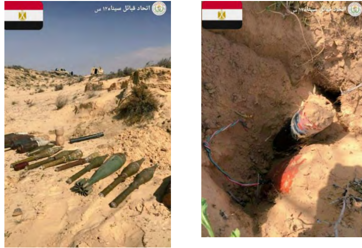
The weapons found (@AlsynawyMrad Twitter account, February 14, 2022)

► On February 14, 2022, the Egyptian army and the tribal forces supporting it located a cache of IEDs, shells and RPG rockets (@AlsynawyMrad Twitter account, February 14, 2022).