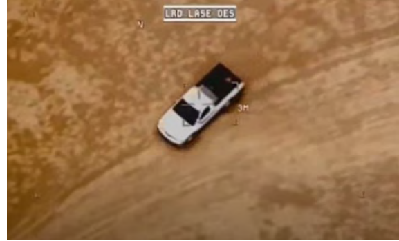
Documentation of the vehicle and the moment it was hit (Iraqi Joint Forces Headquarters, February 18, 2022)