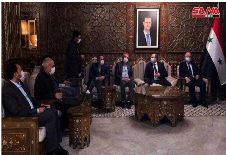
Delegation headed by the Iranian minister of industry and trade visits Damascus. (SANA, November 29)

► The Iranian Minister of Industry and Trade, Reza Fatemi-Amir, arrived in late November for a visit in Syria at the helm of a trade delegation. The visit centered around the opening of an Iranian trade fair in Damascus, and the establishment of a joint Syrian-Iranian trade committee. During the visit, the minister met with senior Syrian officials, including the Prime Minister, Hussein Arnous; Mohammad Samer al-Khalil, the Minister of industry, Economy and Foreign Trade; and Minister of Oil and Mineral Resources, Bassam Tohme (IRNA, November 28).