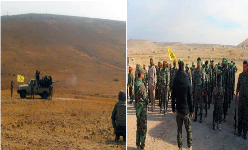
The military drills of the Fatemiyoun Brigade militia in Syria. (Telegram channel of the Brigade, November 26)

► In late November, fighters of the Fatemiyoun Brigade, the IRGC-backed Afghan militia operating in Syria, carried out a major exercise in Syria. The statement issued by the militia reported that during the training, the fighters proved their operational abilities in a joint exercise of special forces, ground troops and armored vehicles, which successfully captured the pre-determined targets without incurring casualties (Telegram channel of the Fatemiyoun Brigade, November 26).